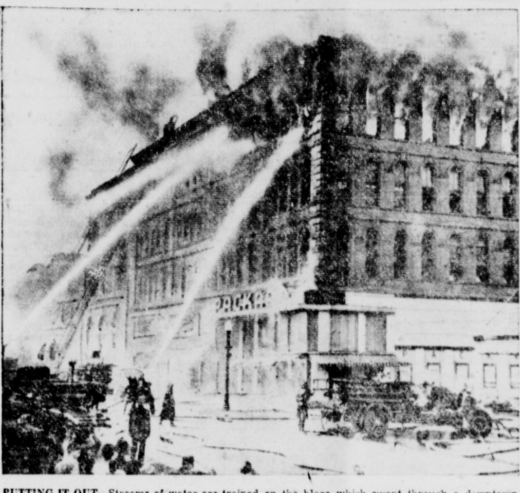
PUTTING IT OUT—Streams of water are trained on the blaze which swept through a downtown business block in Lynn, Mass.