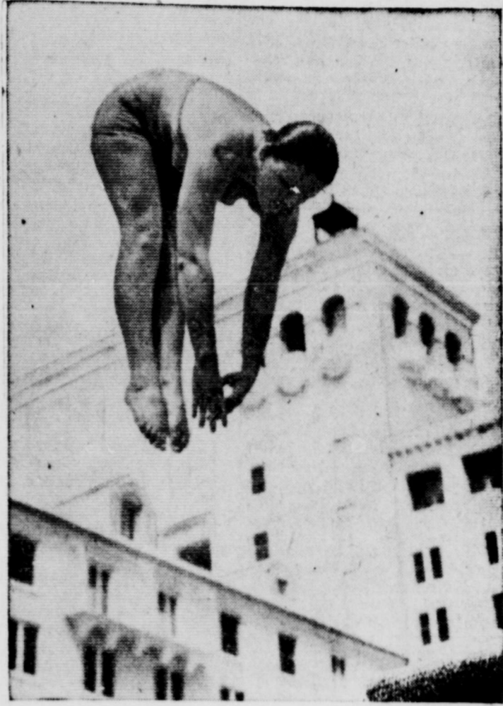
IN A BACK JACK DIVE—Pat McCormick, Los Angeles A.C.'s pride, does a back jack in the three-meter diving event at the Senior Women's National A.A.U. meet in Palm Beach, Fla. Pat was runner-up in the test.