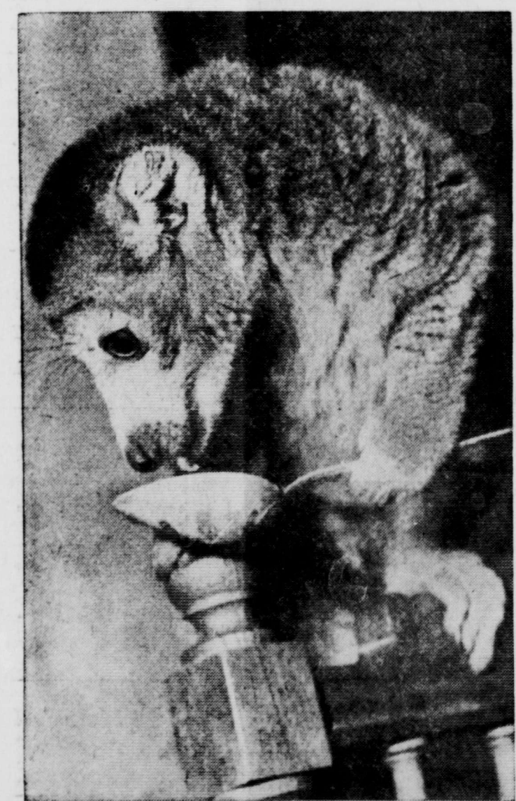
It's really all right—Although it looks as if it might have arrived on one of those talked-about flying saucers, this is only a maki, from French Madagascar. The little creature, now in Paris, resembles a common mouse and behaves like a monkey, and it may reach a height of five feet when it's fully grown.