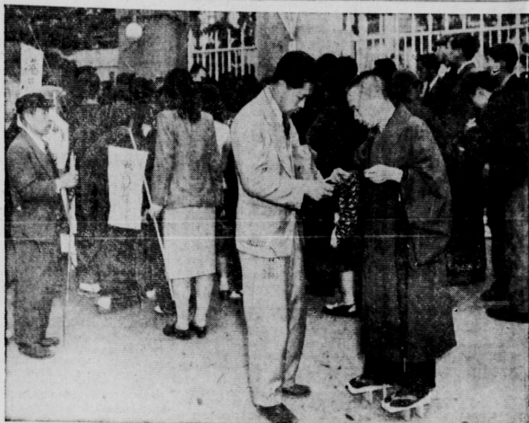
THEY JUST DON'T LIKE IT—Wives, parents and friends of Japanese prisoners of war still being held by the Soviet authorities, stage this mass protest demonstration in front of the Russian Embassy in Tokyo. They were demanding further repatriation of Japanese soldiers from Russian-dominated areas, particularly since the Russians have announced that no more prisoners will be released.