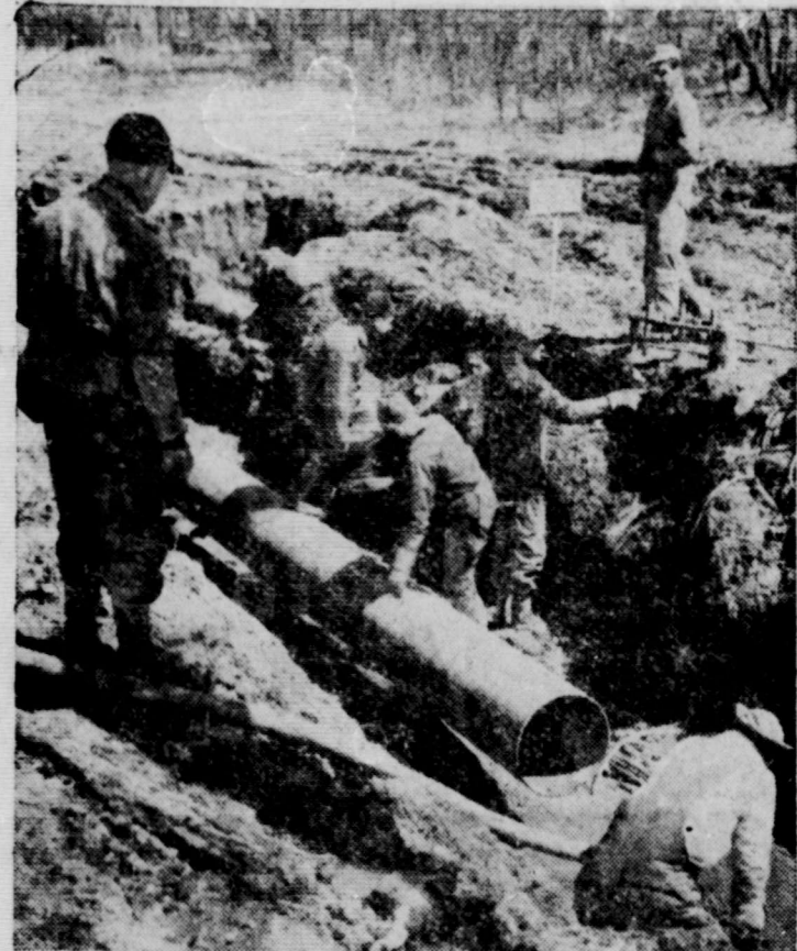
REPAIRING THE LINE—A section of pipe goes into place in the series of repairs on the Big Inch pipeline near Colonia, N. J. Eruptions in the 18-mile section are thought to have been caused by test: of the line for possible use to move pressurized natural gas.