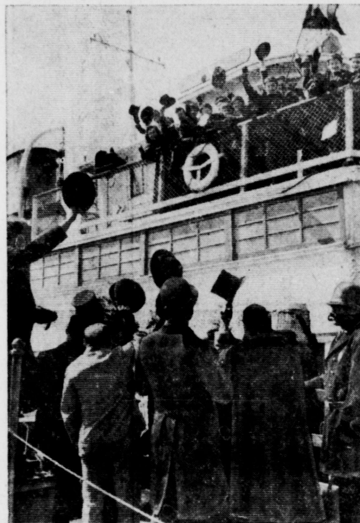
HAPPY ANNIVERSARY! —As part of the observance of the 70th anniversary of the Salvation Army in the U.S., a re-enactment of the landing of the first Salvationists in this country from England in 1880 is held in New York. Participants are dressed in costumes of that period. The first group came ashore in the Statue of Liberty boat and knelt in prayer after landing safely.