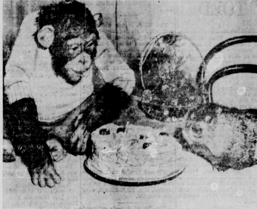
A SOCIAL EVENT—Pandora, a chimpanzee at the Philadelphia, Pa., Zoo, had a lovely birthday party to celebrate being three years old. Susie, a groundhog, and a very good friend of the hostess, was one of the guests. The ladies are shown here admiring the cake they soon ruined.