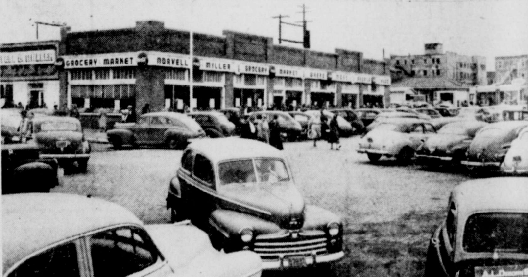
Where Most People Trade