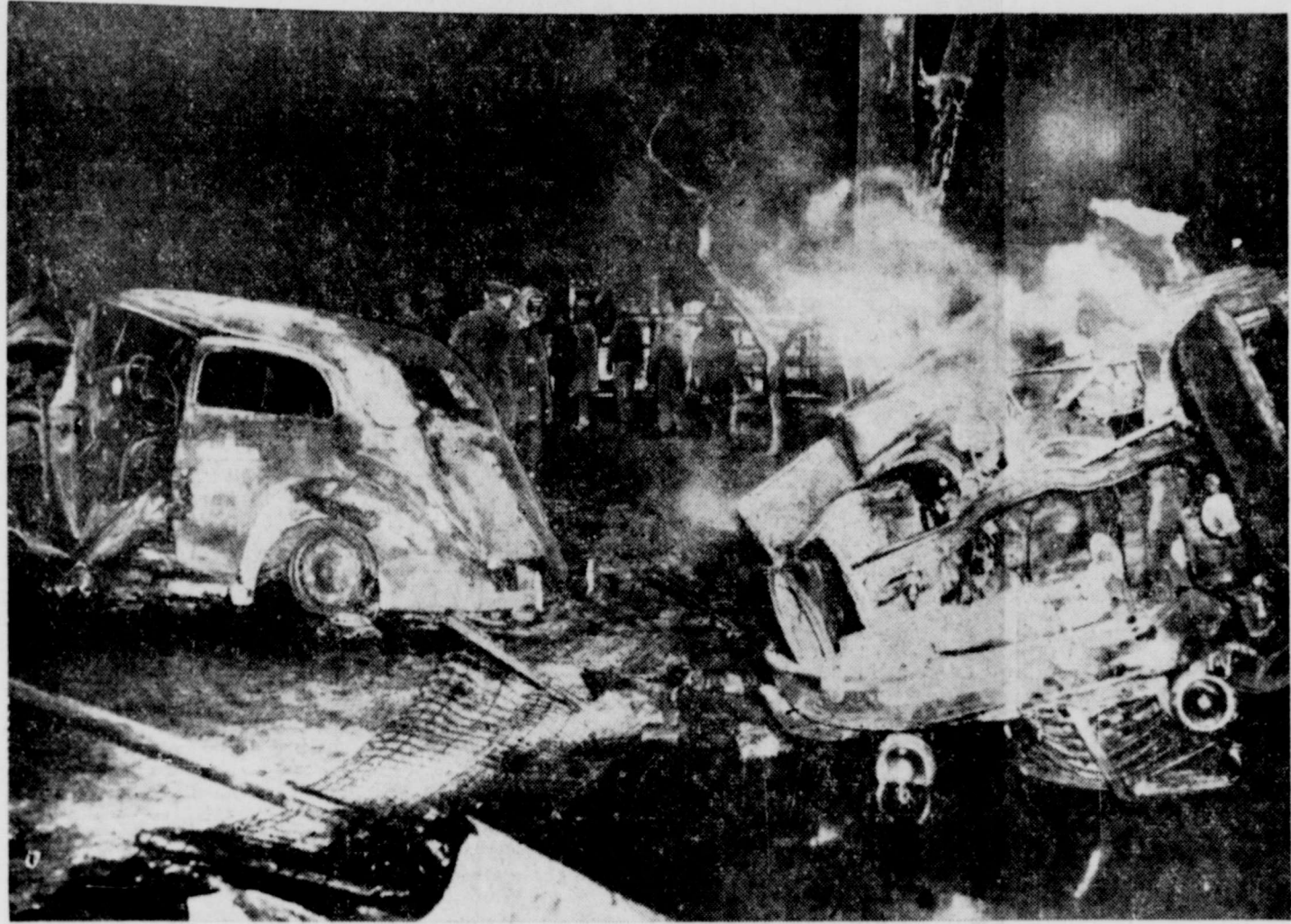
DEATH ON THE ROAD—This is the wreckage of a loaded oil truck, right, which crashed into an automobile and then into a house, spraying both with flaming oil, in Ellerton, O. The house burned to the ground within 20 minutes, and two vehicles were destroyed by the accident which also caused the death of the truckdriver and two passengers in the sedan.

"ROCKET AHEAD" with Oldsmobile from Osborne Motor Company, Eastland