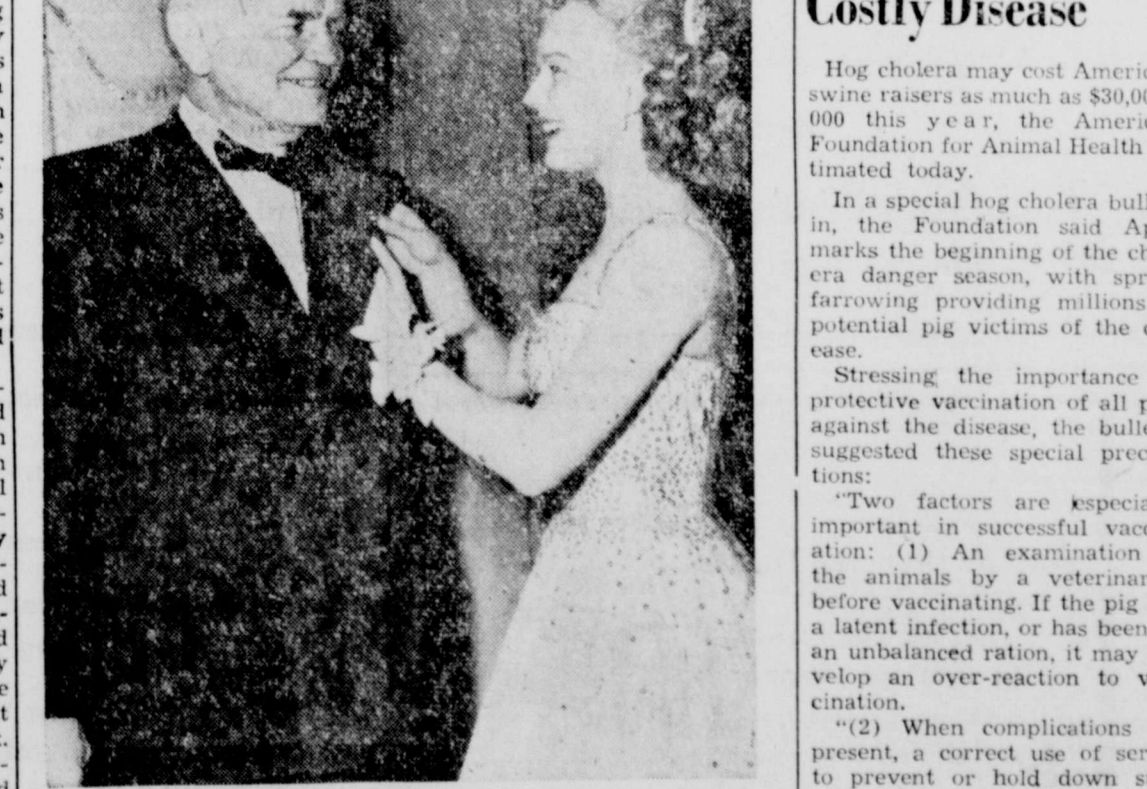
IT'S A DATE!—Admiral William F. (Bull) Halsey visited a motion picture studio in Hollywood and met actress June Haver. The re- tired wartime commander of the famed Third Fleet told her he hadn't seen a movie in more than a year, because of an eye oper- ation. But he promised June she'd be the first star he'd see in 1950.