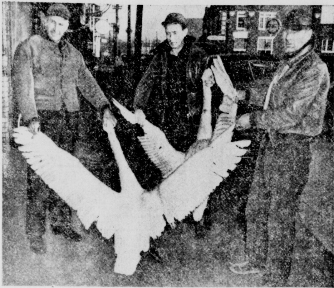
THEY FLEW INTO TROUBLE—Federal and North Carolina game agents display two dead swans, weighing 45 pounds each and with a wing spread of over four feet, in Elizabeth City, N. C. The birds were shot by two brothers in violation of game laws. If convicted, the brothers face a possible six-month prison term or a $500 fine.

"ROCKET AHEAD" with Oldsmobile Motor Company, Eastland