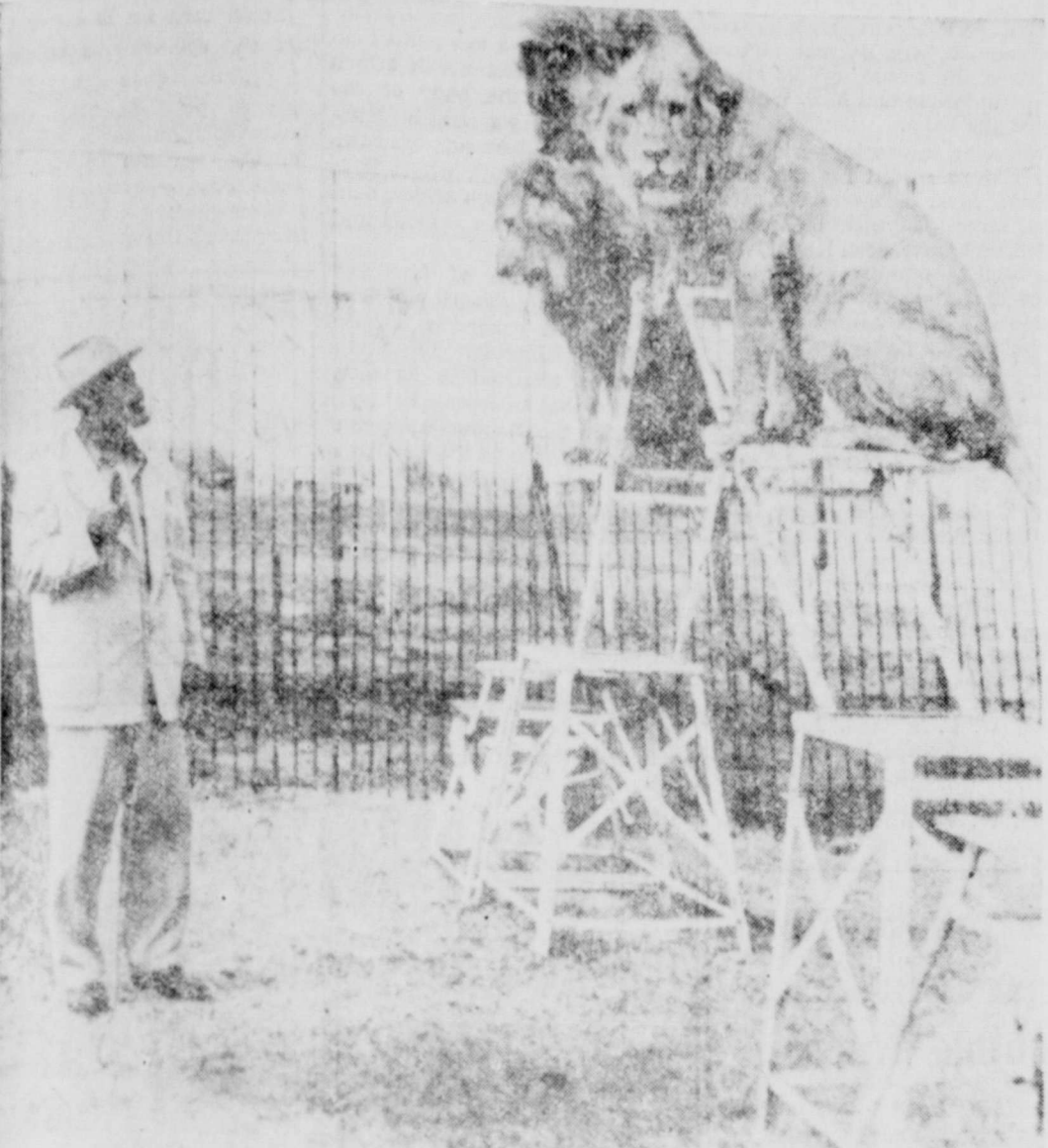
IN THE RING —Retired heavyweight champ Joe Louis is getting acquainted with a new kind of opponent as he enters a circus ring with three lions at their winter headquarters in Gonzales, Tex. If Joe takes a rumored job with the circus, those cats had better get tame in a hurry.