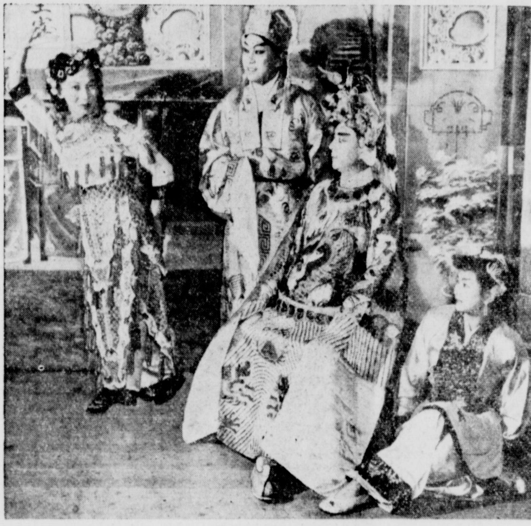
CHINESE OPERA —Players of a Chinese-American theatrical group go through their paces in San Francisco, Calif., in conjunction with the Chinese New Year's. The group, organized four years ago and completely amateur in nature, is attempting to perpetuate Oriental opera. This portrays a court scene with a dancing girl performing for the court sage, a king and a princess.