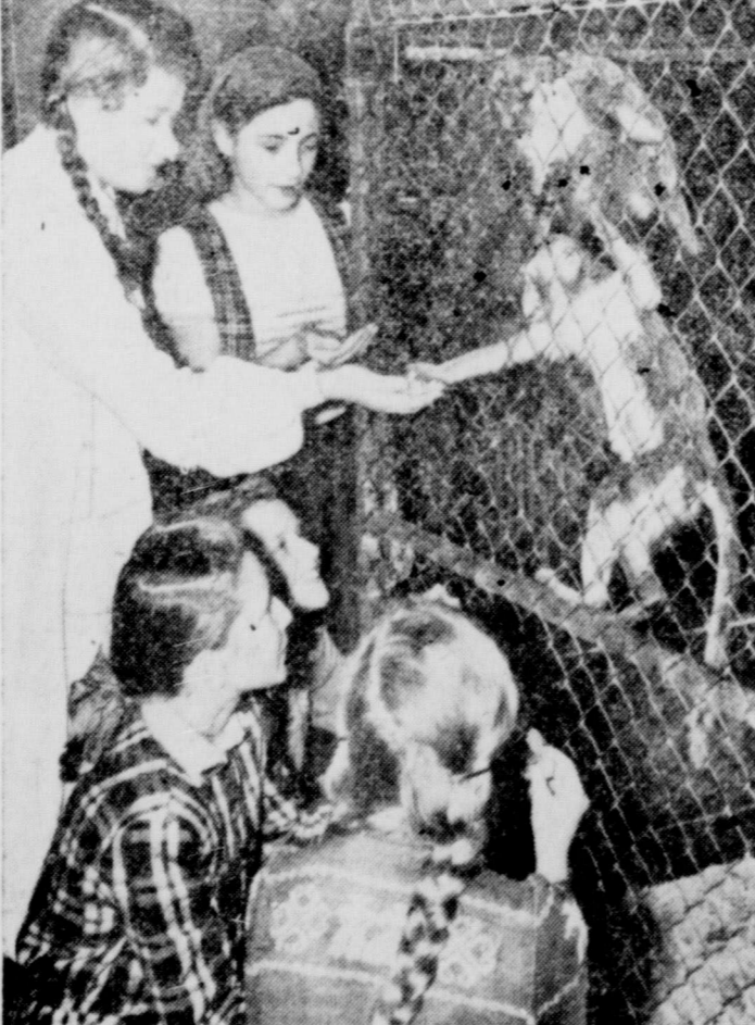
CHOW TIME —These youngsters at a girls' school in the eastern sector of Berlin, Germany, feed two monkeys which were donated to the school's private zoo by the Zoological Garden at Basel, Switzerland. The girls operate the zoo by themselves, and have added quite a collection since the first inhabitant—one white mouse.