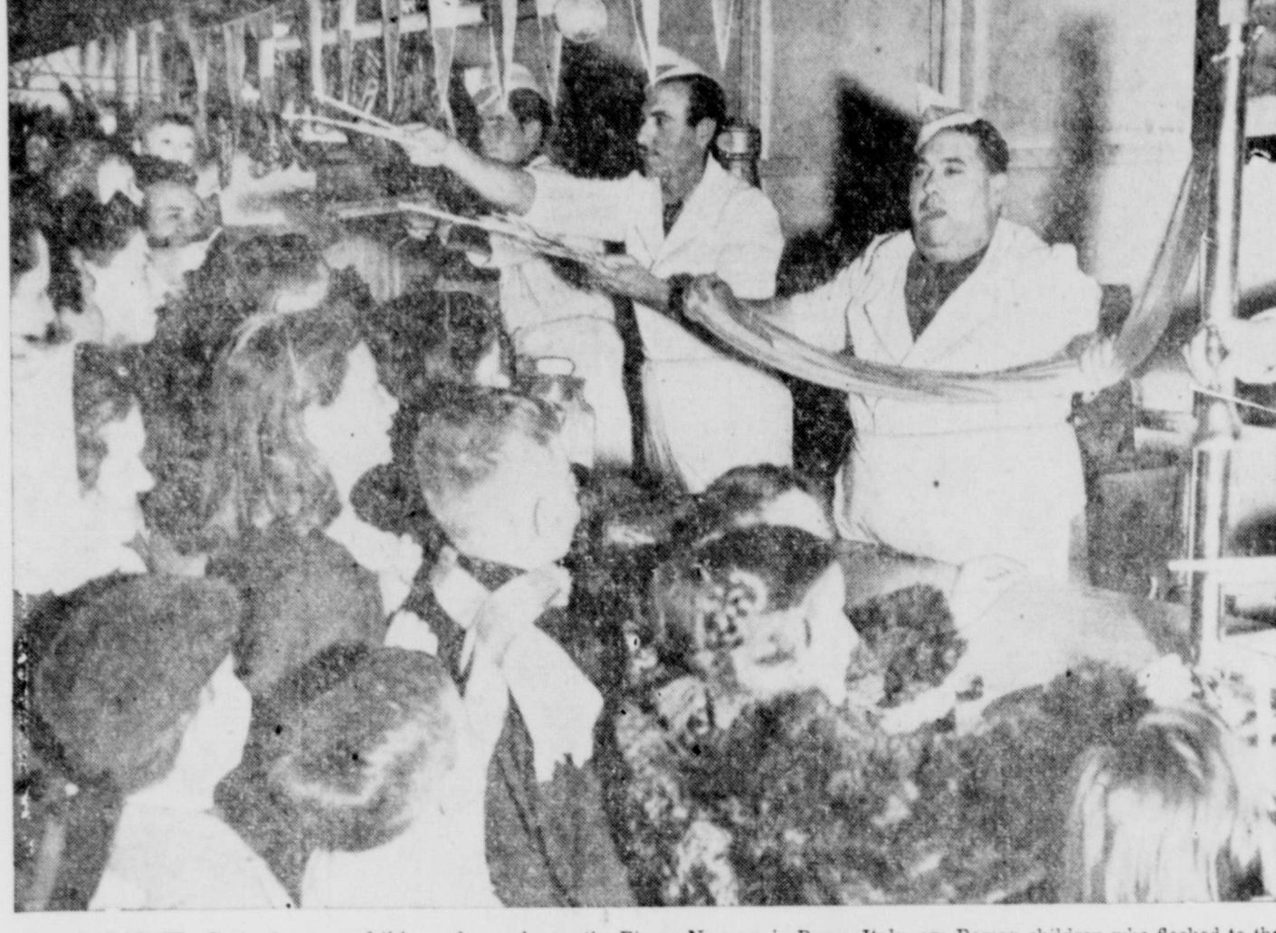
KIDS' PARADISE-Gathering around this candy vendor on the Piazza Navona, in Rome, Italy, are Roman children who flocked to the Square before Epiphany. Toys were also displayed to make the Square a children's paradise for a few weeks