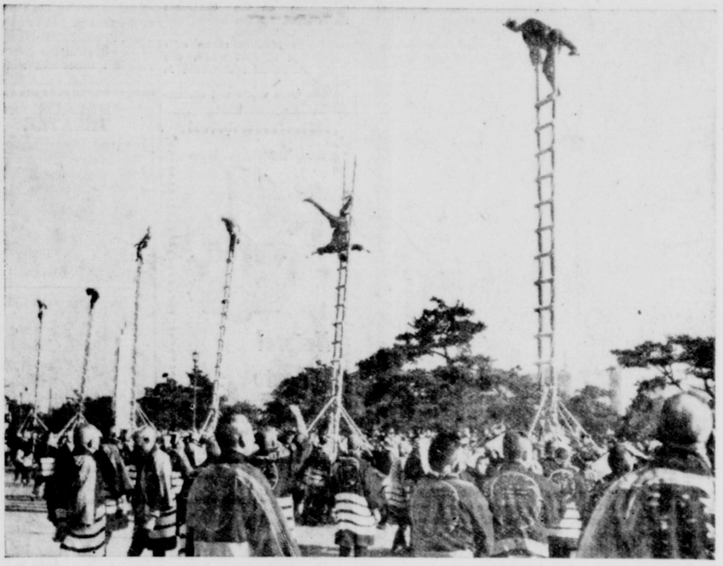
OFF DUTY ACROBATICS —Thousands of onlookers crowd the Imperial Palace in Tokyo, Japan, to watch the breath-taking performance by 1500 firemen. The climax of the day was this spectacular feat performed by 20 competitors. They climbed the high bamboo ladders and balanced themselves in various dangerous positions at the top.