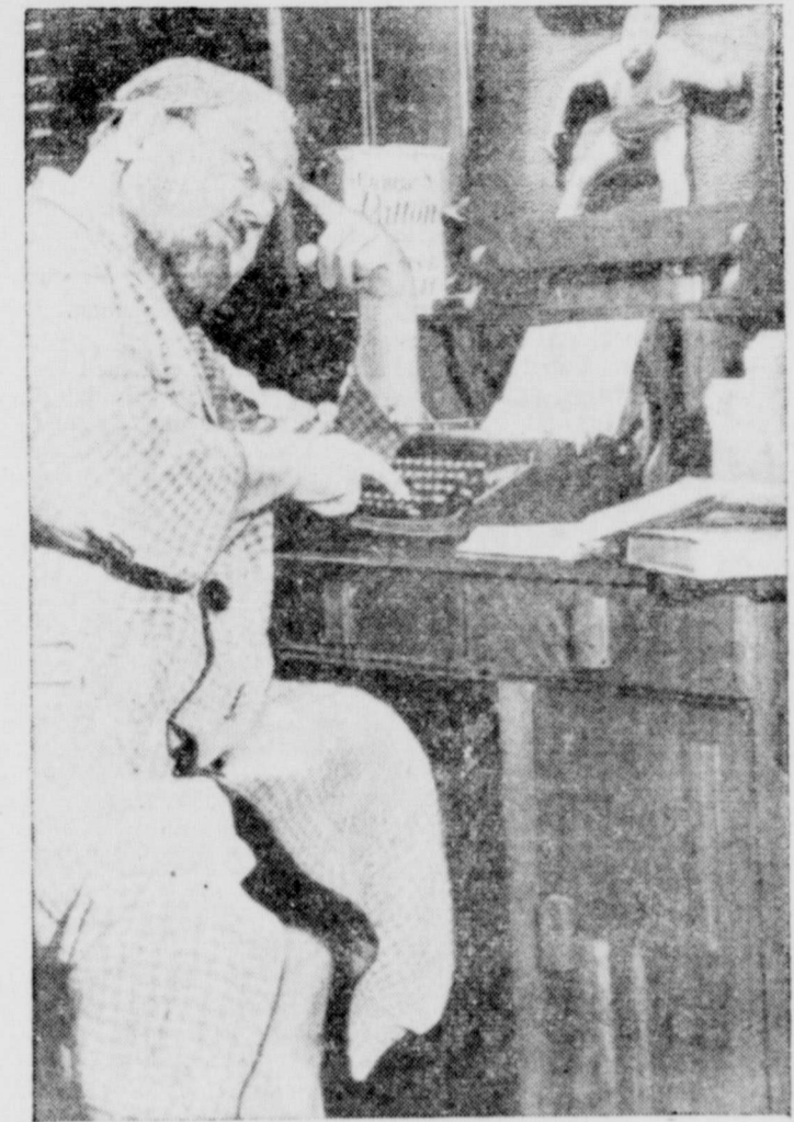
TELLING ALL—Famed wrestler Frank Leavitt, better known as Man Mountain Dean, pecks at a typewriter in Norcross, Ga., as he writes his autobiography. He claims that bathrobe is 40-years old—and it looks as if he's not kidding.

The case was called for last year but the absence of defense witnesses forced a postponement. It was called again for January 16 but was reset for the 24th.