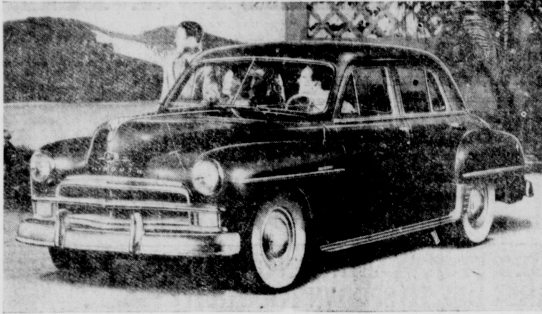
Pictured above is the new Plymouth DeLuxe Four-Door Sedan which will go on display through the Nation Thursday. The new cars will be shown at L and L Motors and Gurney Motor Company in Cisco Thursday, January 12. The car contains important styling changes and improvements for safety and comfort.