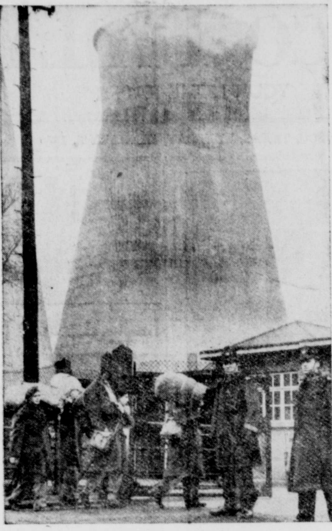
PREPARING FOR CRISIS-When a wildcat strike cut down the electricity supply in London, England, these troops moved into the Brimsdown power station at Enfield. They joined naval ratings who took over the work of about 600 strikers. More than 28 plants were involved.