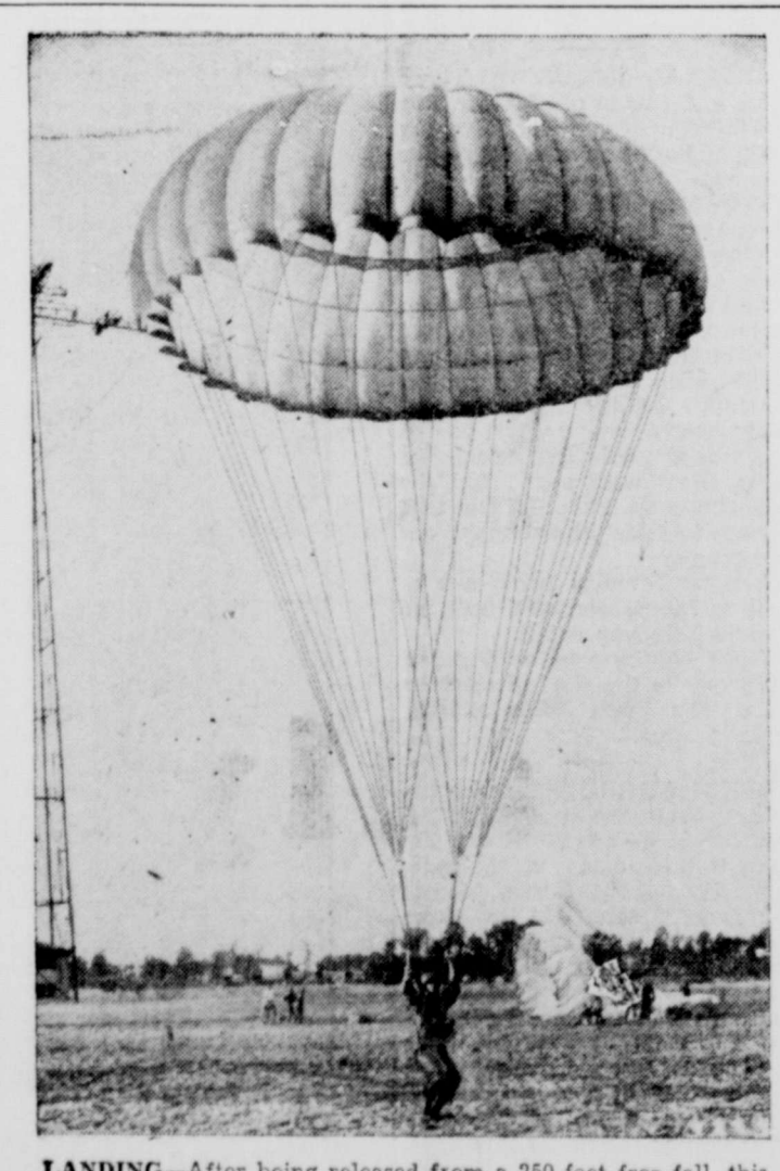
LANDING-After being released from a 250-foot free fall, this paratrooper is taking his first practical lesson in landing, at Fort Benning, Ga. The five-week training period covers glider familiarization, flight rules and safety precautions.