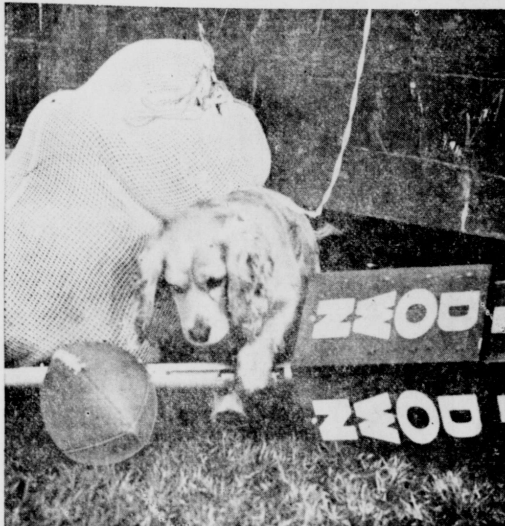
LEMME AT IT! —This eager pup tugs at his leash and sadly eyes the game ball left by officials during halftime of a football game in Seattle, Wash. The downs marker is in front of the pup and the sack at left contains extra footballs, but he'd love to get at just this one.

Make A Date With The "88" Oldsmobile's "New Thrill" Osborne Motor Company, Eastland