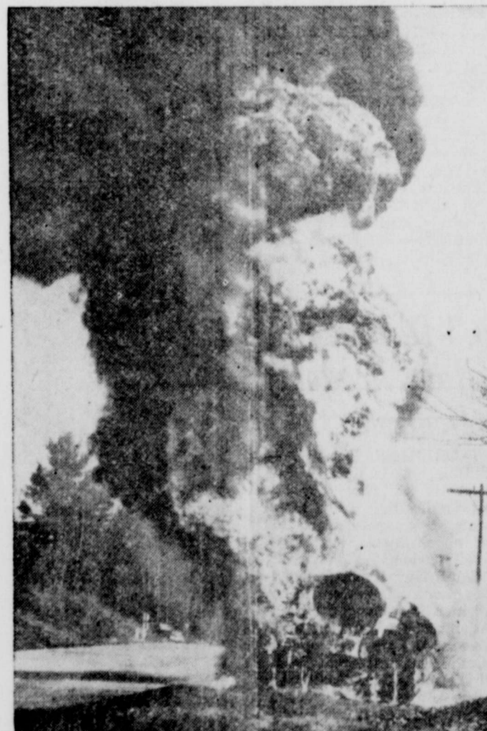
NARROW ESCAPE —When this gasoline tank truck burst into flames near Binghamton, N. Y., William Wright, the driver, leaped to safety. Traffic was held up in both directions while the 4000 gallons went up in the spectacular tower of flame.