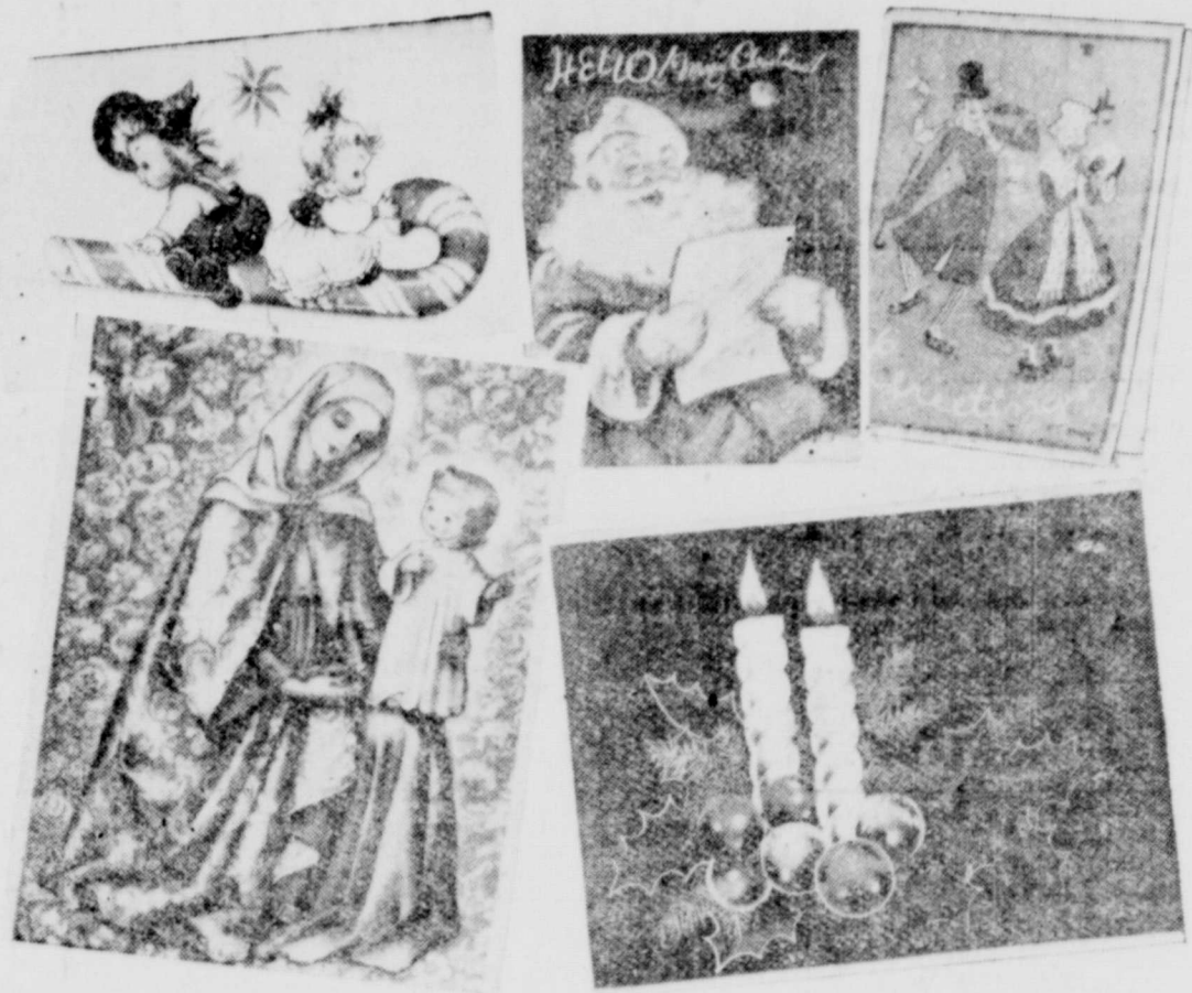
A gay and warm-hearted Yuletide is promised on the 1949 Christmas cards. Scenes of children skating, sledding, and juvenile pranks bedeck the sprightly greetings. One card is in the shape of a barrel—to wear after you pay your Christmas bills! While novelty greetings are in heavy demand, religious Christmas cards also have shot forward in popularity. Publishers estimate that 1,600,000,000 Yule cards will brighten the nation's holiday mail—about 100,000,000 more good wishes than last year.