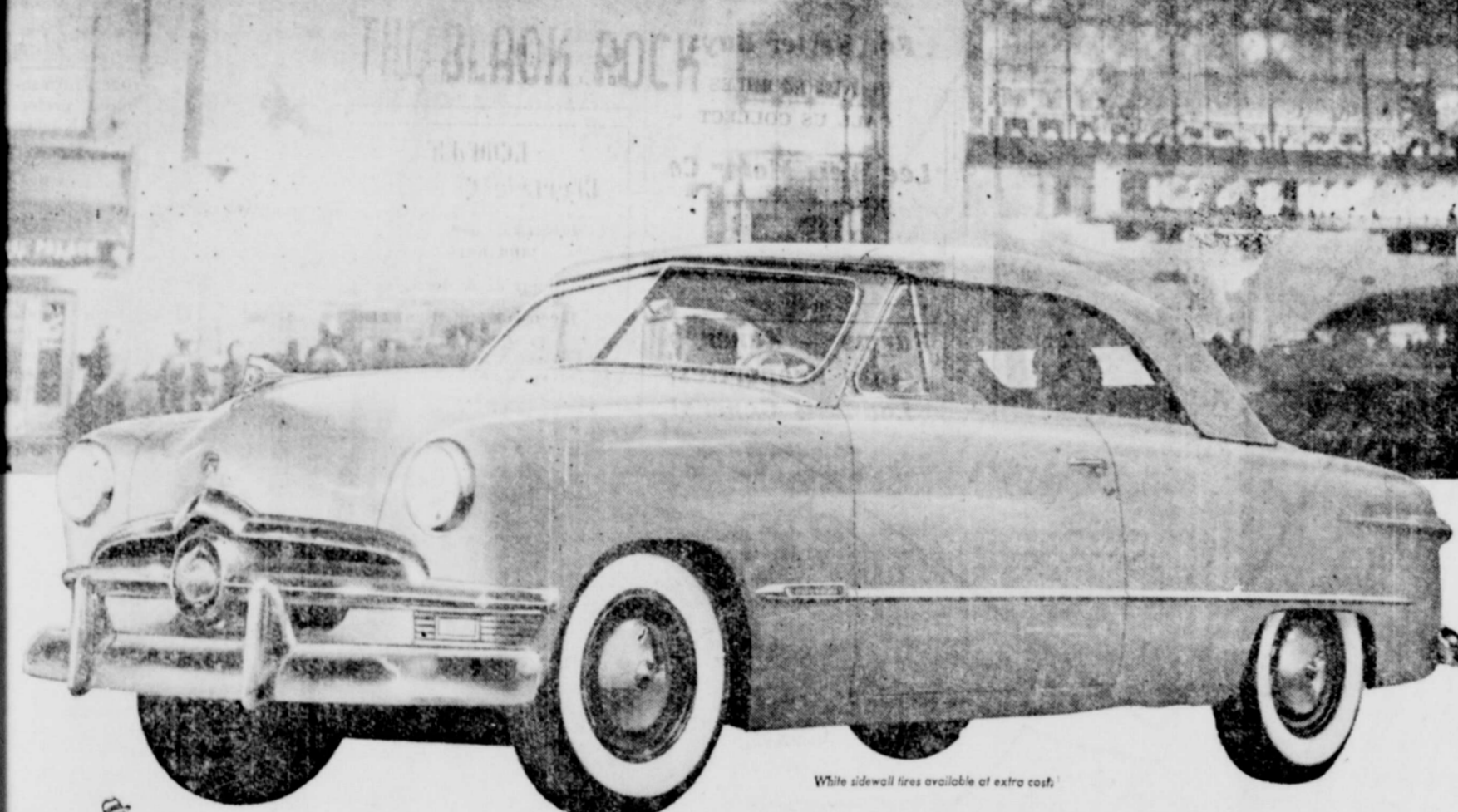
White sidewall tires available at extra cost.

Ford is 50 ways new for '50... packed with improvements that make it the finest car of its field. For Ford brings you an even smoother "Mid Ship" Ride on wide new foam rubber front seat cushion with new non-sag seat springs... a new silent ride in Ford's 13 ways safer, "Lifeguard" Body with more extensive body insulation and sealing in 41 areas.