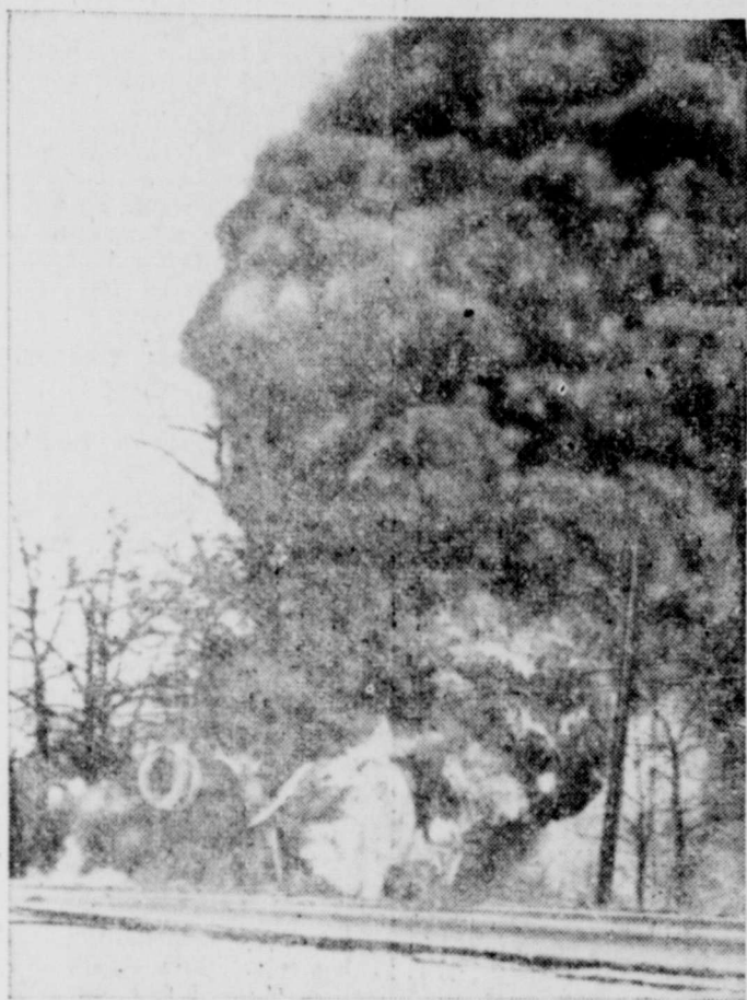
GOING UP—Smoke billows in a huge cloud from a gasoline-carrying trailer after it overturned on a highway near Chicago, Ill. The gas exploded and burned when the truck skidded off the road and overturned.

Doctors were present from Abilene, Brownwood, Sweetwater, Colorado City, San Angelo and Cisco.