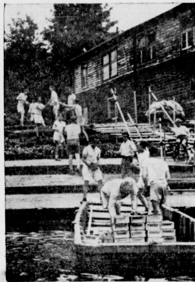
EVERYONE'S IN ON IT—Members of the rowing club in Twickenham, England, decided they needed a new boathouse and the cheapest way was to build it themselves. Here they load brick for transportation to the building site via a brick brigade.

The index whose base year 1926 equals 100 was at 180.89 at the end of the year ago week. The textile component reached a new 1949 high at 157 compared with 154.70 last weekend.