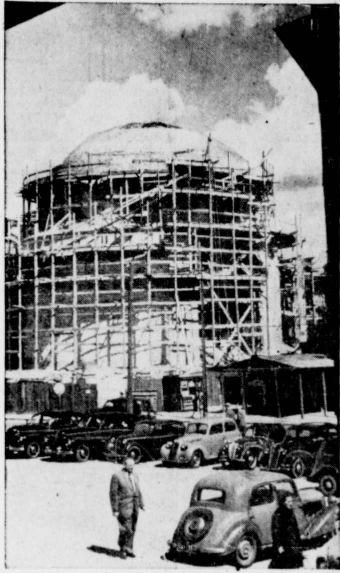
RIISING FROM ASHES—The Catholic church of St. Alexander, in Warsaw, Poland, was totally destroyed by Nazis during the war and is now being rebuilt. The restoration of churches is said to be part of the general plan of reconstruction.

Argentine Eats More Meat Than Any Other Nation