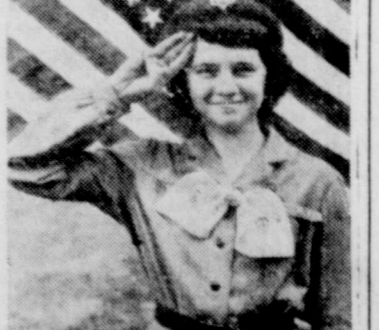
More than a million Girl Scouts will receive the nation's salute as they celebrate Girl Scout Week Oct. 30-Nov. 5.

For Good Used Cars (Trading on the new Olds) Osborne Motor Company, Eastland