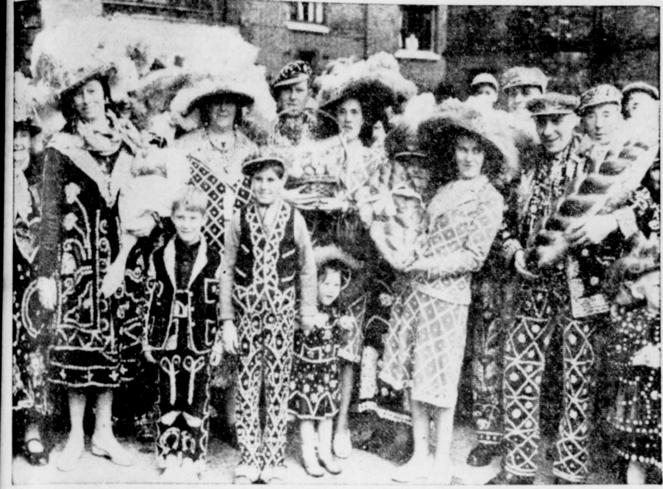
LOTS OF BUTTONS—Pearly kings and queens pose with their gifts of flowers, fruit and bread before the annual service and festival at St. Mary Magdalene Church in London, England.