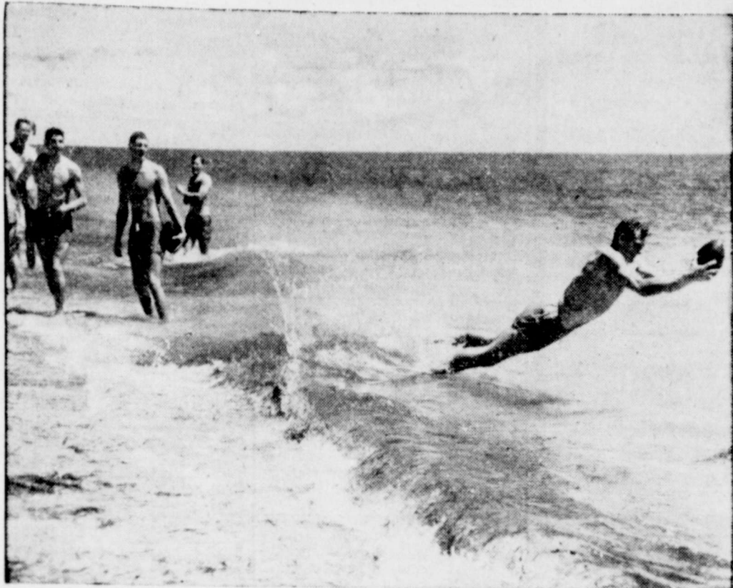
PIGSKIN PLUNGE—This player got a sudden notion to go in for a dip during the University of Miami football practice at Miami, Fla. He hadn't planned it that way, however.

The election was conducted by mail referendum.