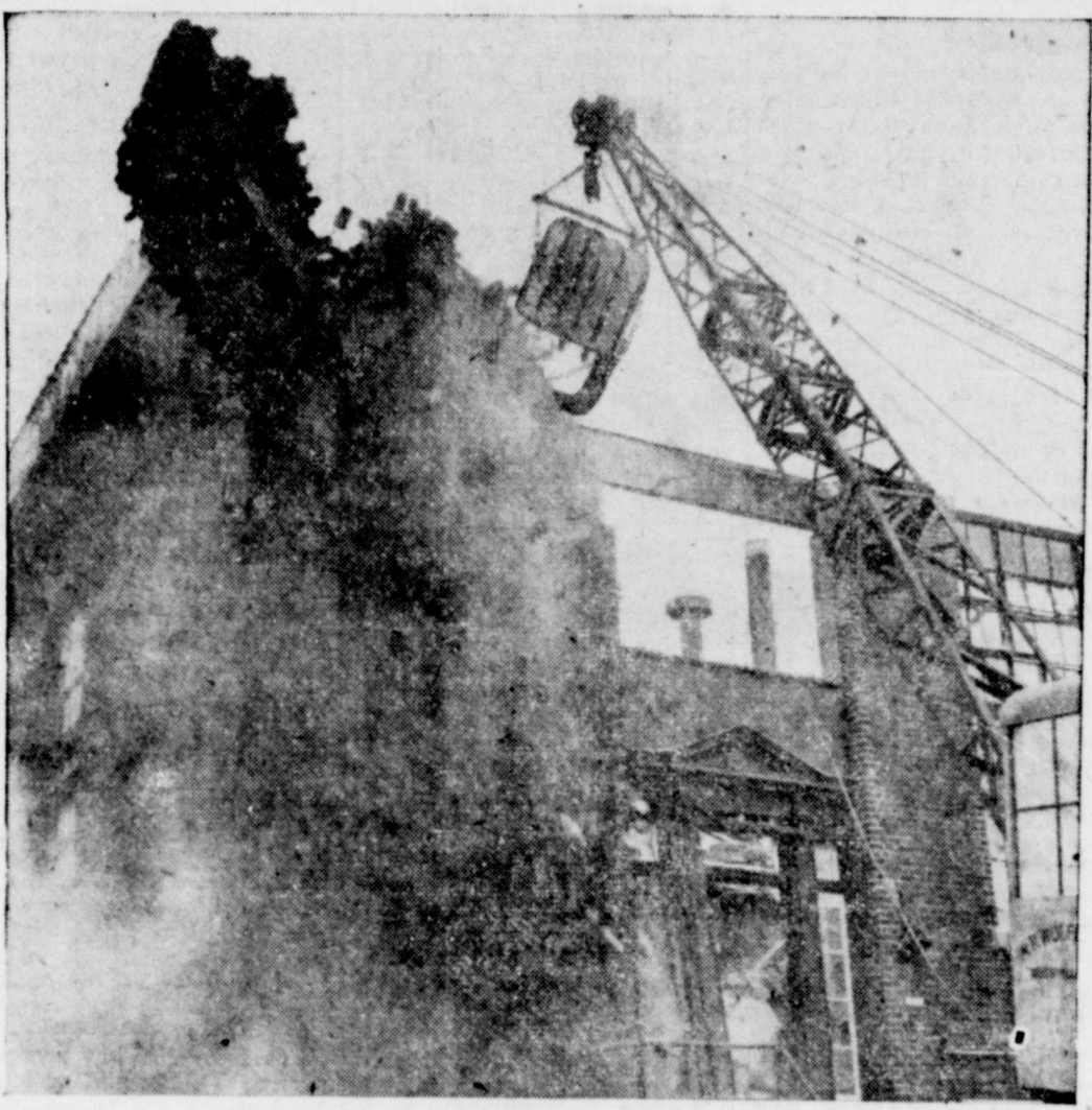
TRYING TO REACH THE VICTIMS—Two men were killed and others unaccounted for when a turbine room of a power company blew up in Rushville, Ind. Workmen are knocking down a brick wall to allow rescue men to reach those buried in the debris. Ten state police units helped out.