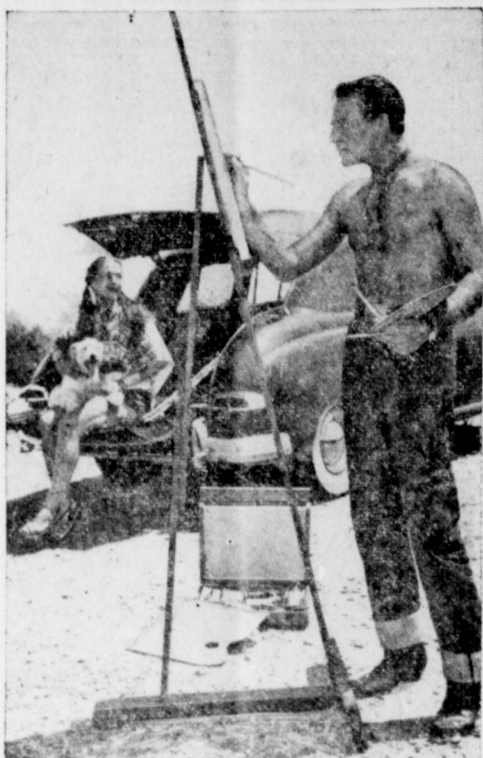
TRYING HIS HAND—Actor Henry Wilcoxon, whose paintings will be exhibited in Los Angeles this fall, takes brushes and palette in hand on a nearby hill as Joan Woodbury falls into a pose.