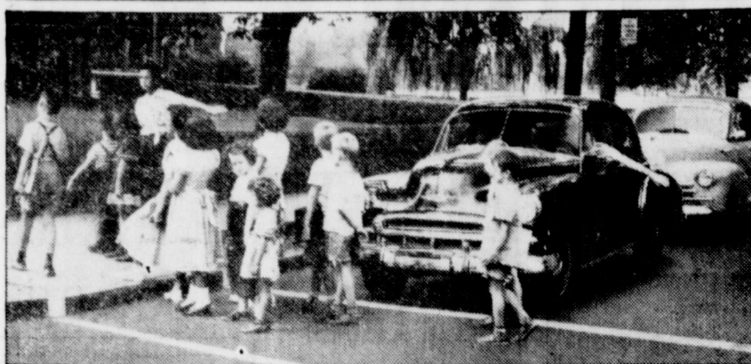
As schools reopen this fall for America's 8,000,000 children a vast army of safety patrol boys, 350,000 strong, will help law enforcement agencies protect them from the traffic dangers at street crossings. This typical picture shows patrol boys permitting children to cross on their way to school while traffic has stopped.