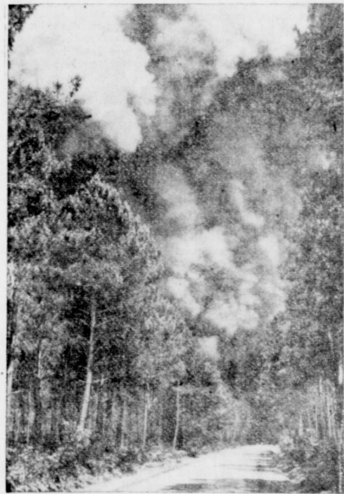
FRANCE'S WORST—The sky is black and flames roar above the forest of France, a few miles from Bordeaux, as the worst fire in the history of France still burns two days after it was reported under control.