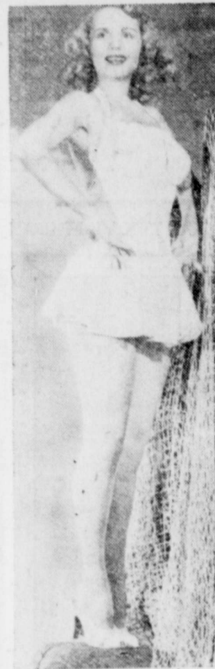
AT LAST! — It took a long time, but beautiful Marie Wilson, in Hollywood, has finally become a film star. She also does all right on the radio.

Look not mournfully into the past. It comes not back again. Wisely improve the present. It is thine. Go forth to meet the shadowy Future without fear and a manly heart — Henry Wadsworth Longfellow.