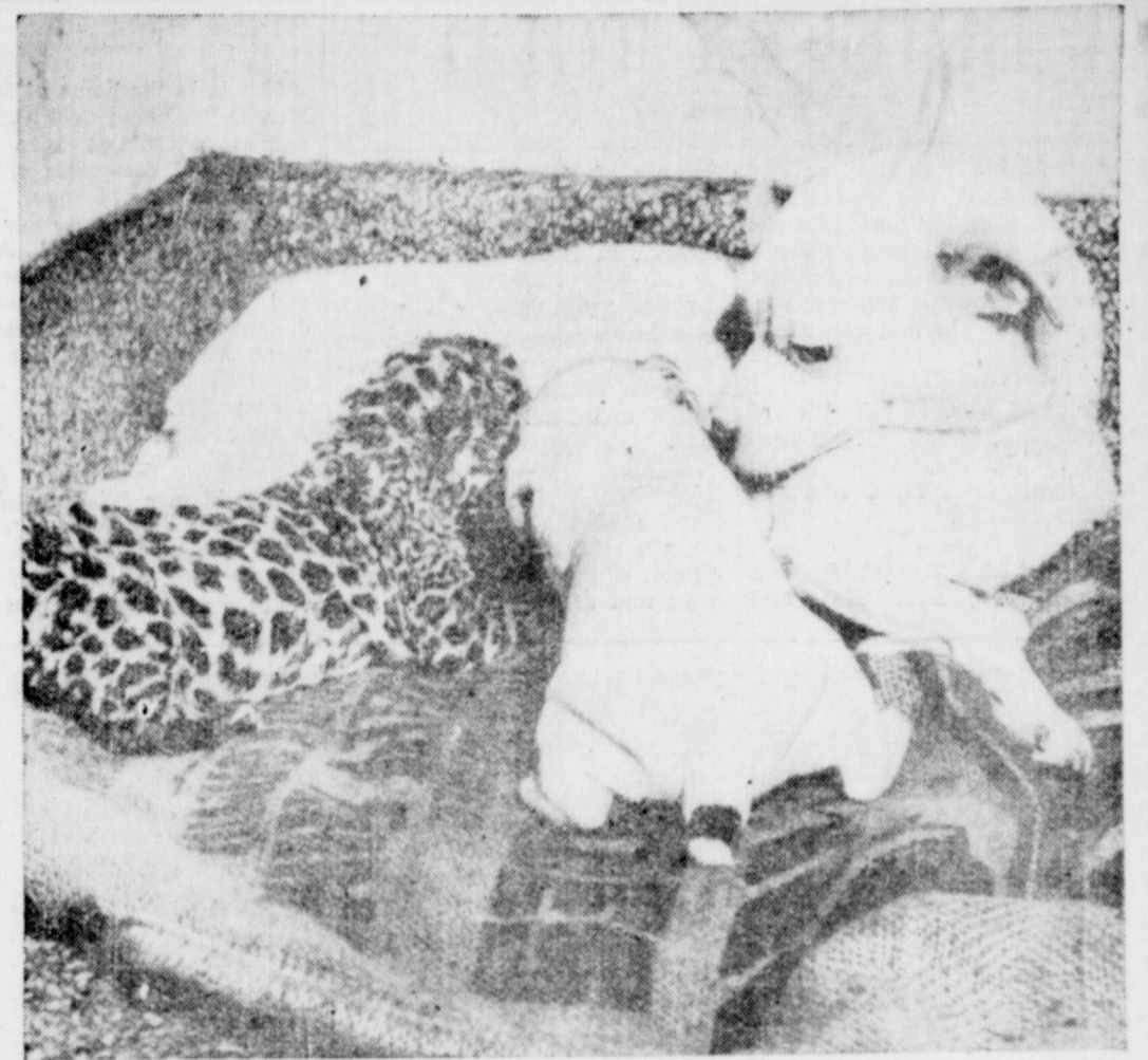
STRANGE BEDFELLOWS —The fox terrier mother turns around with a look of bewilderment at the spotted fellow having his dinner. The stranger is a newborn jaguar from the Milwaukee, Wis., Zoo. The baby was taken from its mother, who has a habit of destroying offspring, and the dog adopted it.

Back to school specials Guaranteed Cream Oil Permanent wave complete with shampoo and set. Regular $5.00 now 2 for $8.00 Regular $6.50 now 2 for $11.00 Regular $7.50 now 2 for $13.00 Regular $8.50 now 2 for $15.00 New Equipment Janette's Beauty Shop Call 302-J for appointment, two blocks east of East Ward School.