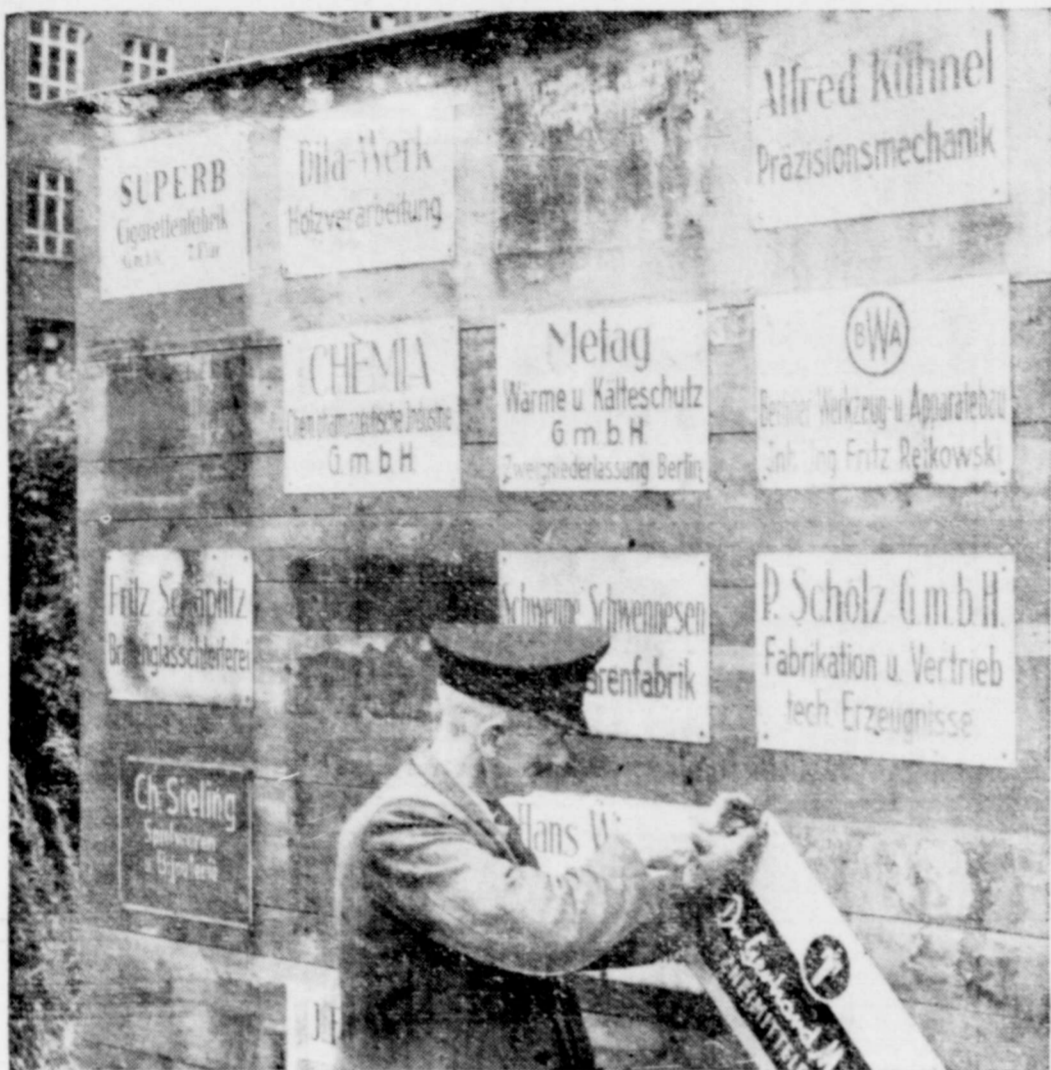
TIGHTENING UP —With one out of four Berliners out of work, skyrocketing unemployment is jeopardizing the shaking economic stability of the Allied sectors. Eight firms are out of existence in British sector as seen by blank spots where name plates were once tacked up on poster. Another firm falls by the wayside as this workman takes down the name plate.