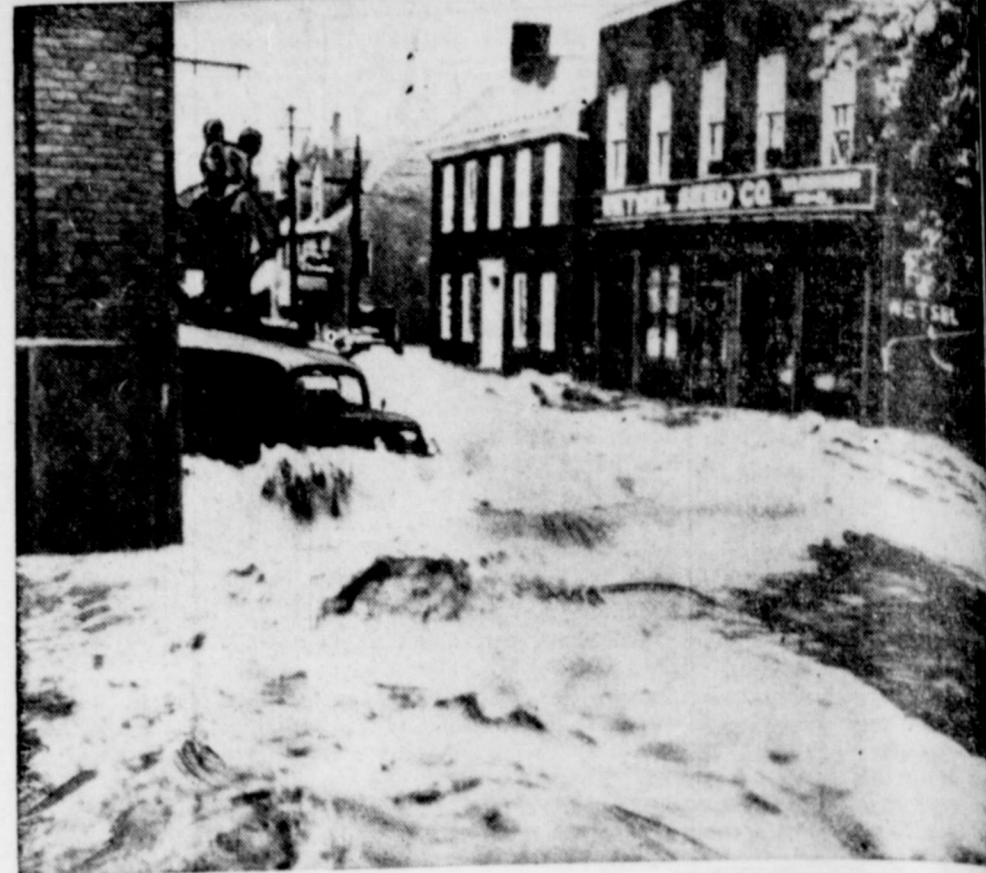
NATURE'S FURY —Water several feet deep cascades down Liberty Street in Harrisburg, Va., after heavy rainfall brought on a flash flood. Autos were washed along and one department store collapsed. No casualties were reported, but 20 families were left homeless.