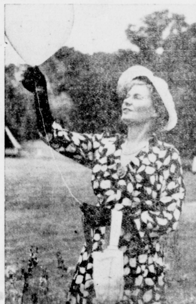
OPENS GARDEN FETE—Mrs. Clement Atlee, wife of the British Prime Minister, releases her balloon during a contest of the United Nations Association's garden fete at Bedford College in London, England. Mrs. Atlee opened the fete.

Most Antarctic explorers have been English.