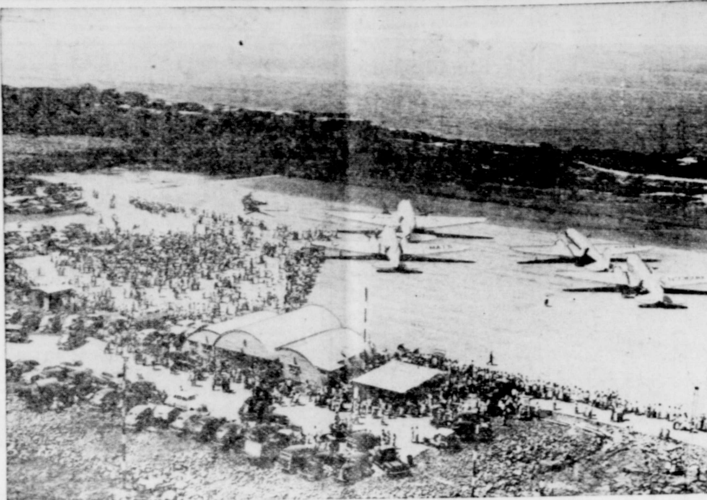
MODERN AIRFIELD ON SITE OF ANCIENT VILLAGE—This crowd is attending ceremonies for the opening of the new Kona Airport on the island of Hawaii. It is a territorial airport which occupies the site of an ancient Hawaiian village.