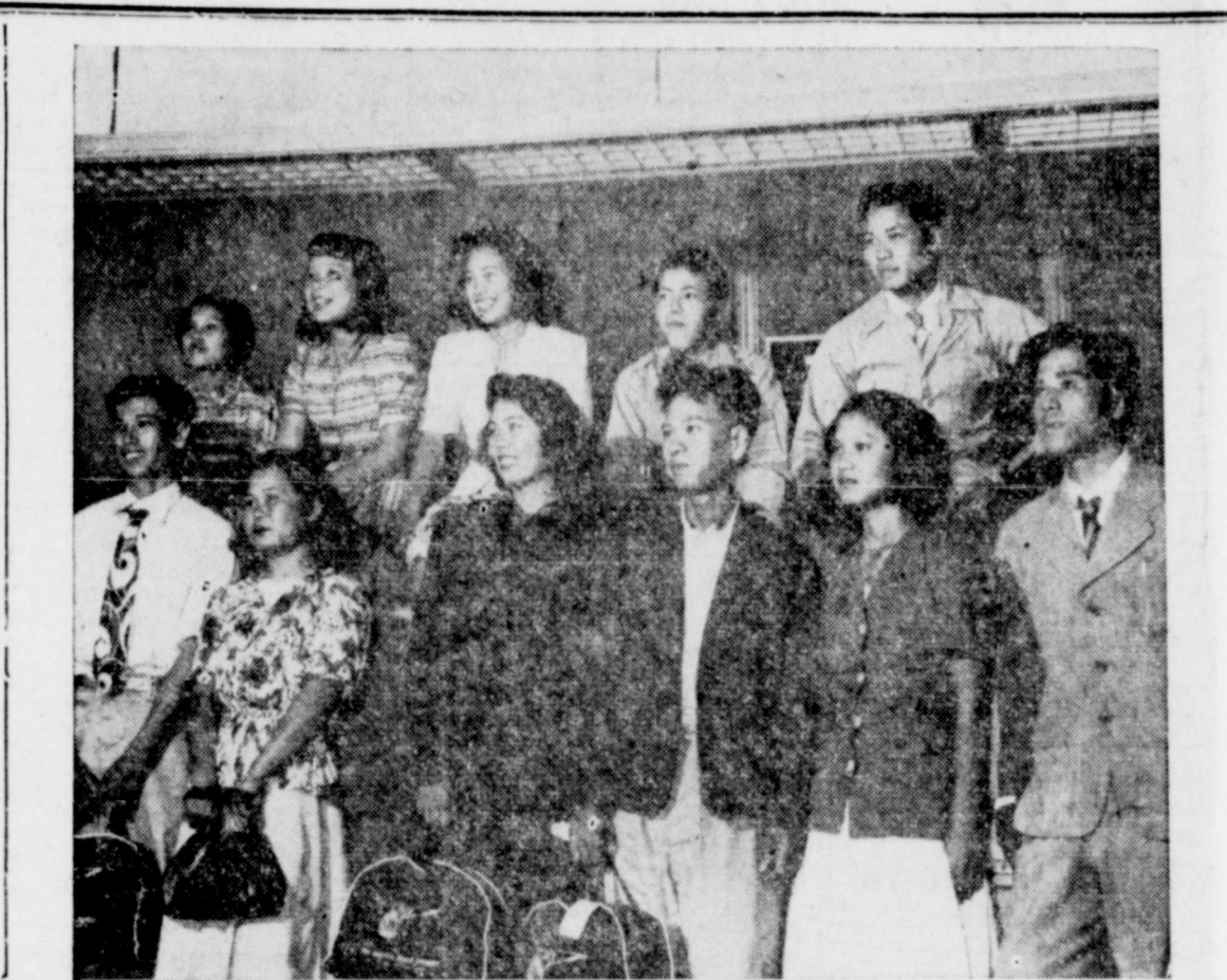
Okinawa, en route to Argentina. Said to be the largest family group ever to fly the ocean they are part of the Okinawans moving to Argentina after being caught in Japan by the war.

Make A Date With The "88" Oldsmobile's "New Thrill Osborne Motor Company, Eastland