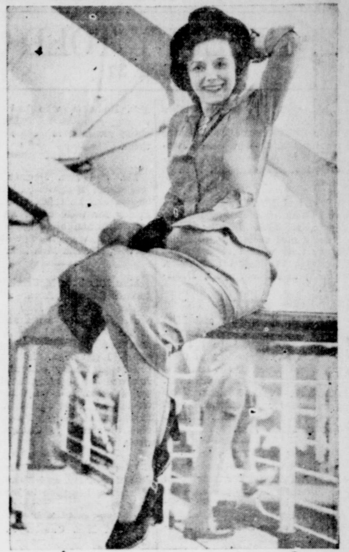
LOOK WHO'S BACK —Ethel Smith, the organist who is noted for her down beat, returns to New York on the Queen Mary after making a tour of Europe. She'll soon be in a new Hollywood film.