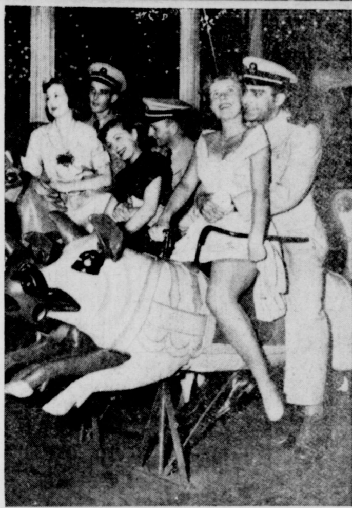
ROUND AND ROUND —Getting away to a fast start on the merry-go-round at Steeplechase Park, in Coney Island, N. Y., these midshipmen from Annapolis are out to have some fun. With their fair companions, 51 of the men spent several hours at the resort and took in all rides and attractions they had time for.