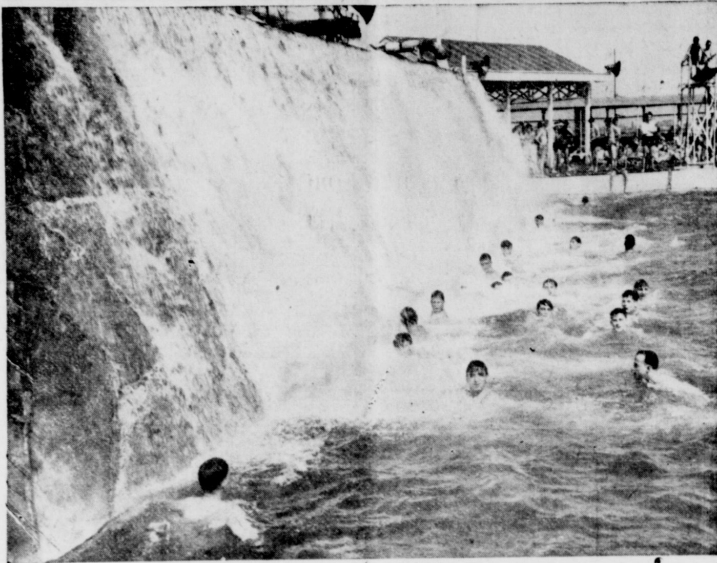
THE RIGHT PLACE TO BE —These youngsters know what to do when the temperature soars into the nineties and threatens to stay there. They're enjoying the splash of water under the falls of a pool at Palisades Park, N. J., and when old Sol's rays beat down unmercifully, there's no more comfortable place to be than under a waterfall.