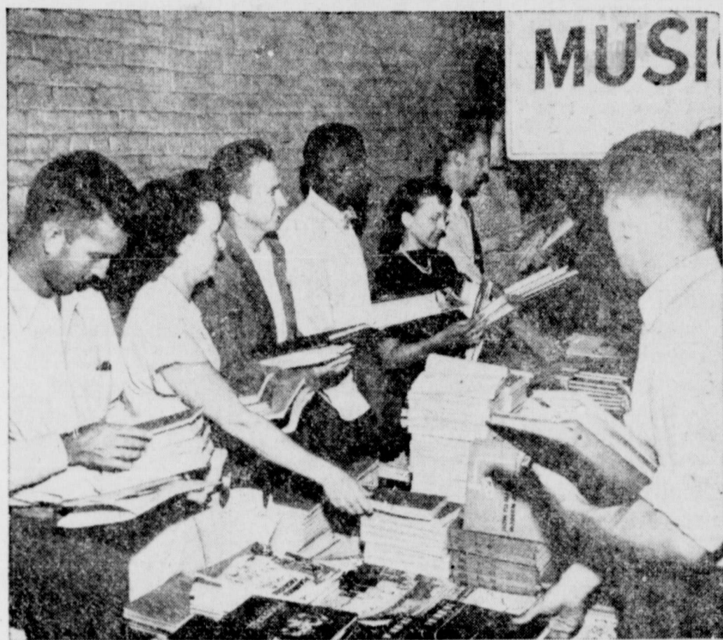
HELP YOURSELF—Students at Columbia University's Teachers College, in New York, serve themselves to texts at the "Bookateria." The books are arranged alphabetically on a long, narrow table and the system is said to chop two hours off each student's book-buying time.

For Good Used Cars (Trade-ins on the new Olds) write Motor Company, Eastland