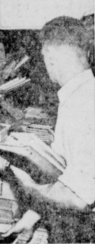
HELP YOURSELF—Students at Columbia University's Teachers College, in New York, serve themselves to texts at the "Bookateria." The books are arranged alphabetically on a long, narrow table and the system is said to chop two hours off each student's book-buying time.