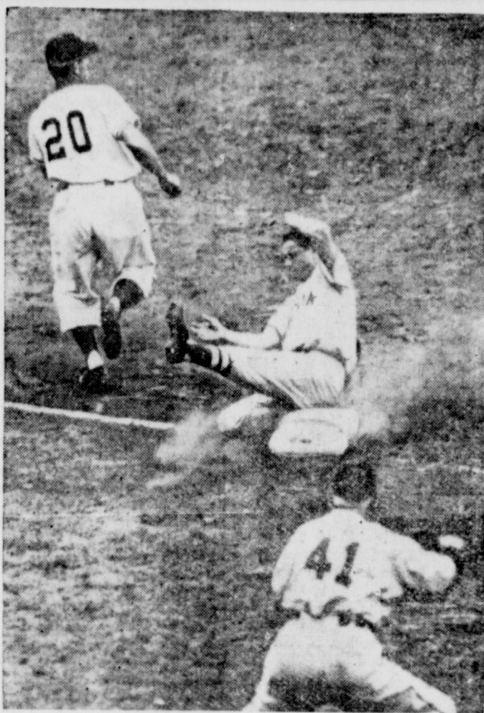
STEPPING ALONG —Dom DiMaggio of the Boston Red Sox is about to right himself after sliding into third base on long fly from teammate, Ted Williams, in All-Star game at Ebbets Field in Brooklyn. National League's Sid Gordon is covering the base.

Following the marriage ceremony the couple left for a short wedding trip after which they will make their home at Prairie Grove, Arkansas.