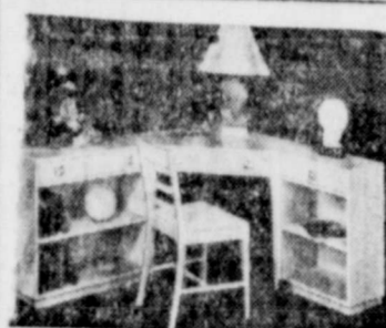
For living room, bedroom, or the one-room apartment — this three-piece sectional unit illustrates the flexibility of today's furniture. The grouping includes a 30 inch open-front bookcase, a corner writing desk that also doubles as a dressing table, and a 28 inch bookcase. Each section has a convenient drawer. Made of sturdy oak, with a smart Champagne finish, this unit is part of an entire grouping which includes many styles in companion tables.