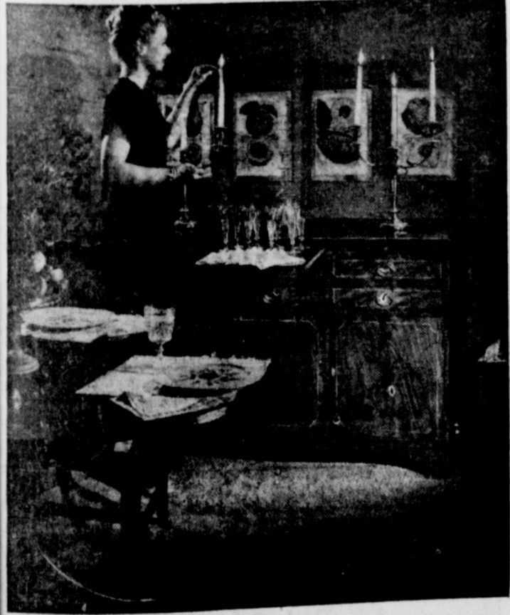
The new "Butler Buffet" is smart proof that 18th Century designs can be functional without losing any of their traditional beauty. This magnificent piece with swivel mahogany front and inlaid border is specially engineered to provide plenty of storage space for almost every dining requisite. There are sectional drawers for silver—a small drawer for candlesticks, place mats, napkins, etc. Three pull-out trays are for convenient serving space. There are also deep drawers for linens—shelves for china—and a specially grooved section for trays and platters. In addition, a surprise feature of the buffet is a concealed drawer in the base, which holds extra table leaves and eliminates the storage problem.

FIRST CHRISTIAN CHURCH 301 West 8th St. RICHARD W. CREWS, Minister. 9:45 a. m.—Bible School. 10:55 a. m.—Morning Worship. 6 p. m.—Young People's Meeting. 7:30 p. m.—Evening Worship. Mid-week Services — Wednesday 8 p. m.