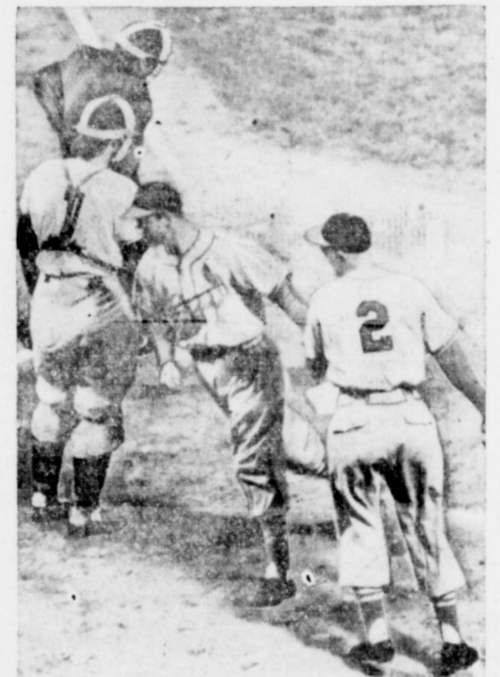
OLD STUFF—Stan Musial, of the St. Louis Cardinals, crosses home plate after hitting a homer in the first inning of the Cardinals game in New York. Red Schoendienst, 2, who was on base at the time, shakes Musial's hand in congratulation.