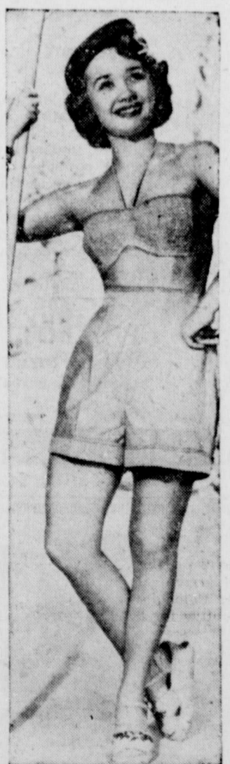
ALL SET — Actress Jane Powell, in Hollywood, is ready for her summer gardening in this chambray outfit which features slim cuffs banded by French piping.

For Good Used Cars Trade-ins on the new Oldsmobile Motor Company, Eastland