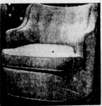
This revolving chair is called the "Television" chair because its swivel base makes it possible for one to turn in any direction to view a program without rearranging the furniture. Upholstered in foam rubber and covered in one of the newest textured fabrics, the chair has the luxurious appearance and comfort of a conventional lounge chair.