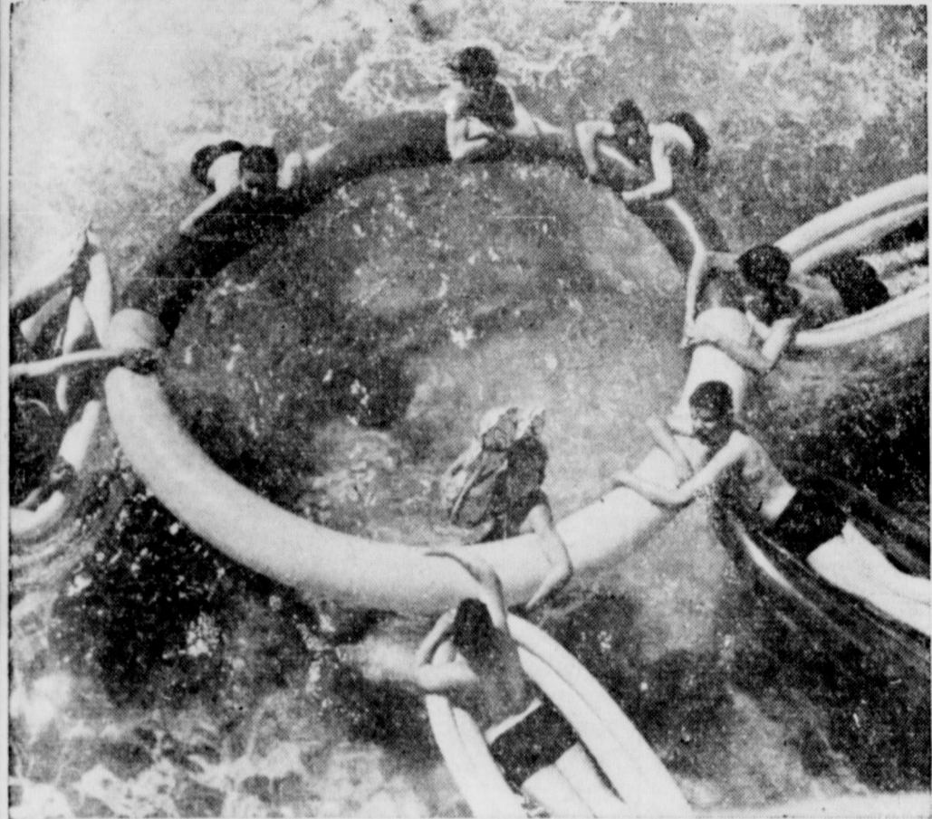
HAVING FUN—These boys from New York and New Jersey Boys' Clubs are not afraid of the water. On an outing at Palisades Park, N.J., they made the most of the plastic boats that were placed at their disposal. Water sports are an age-old source of fun to growing lads.