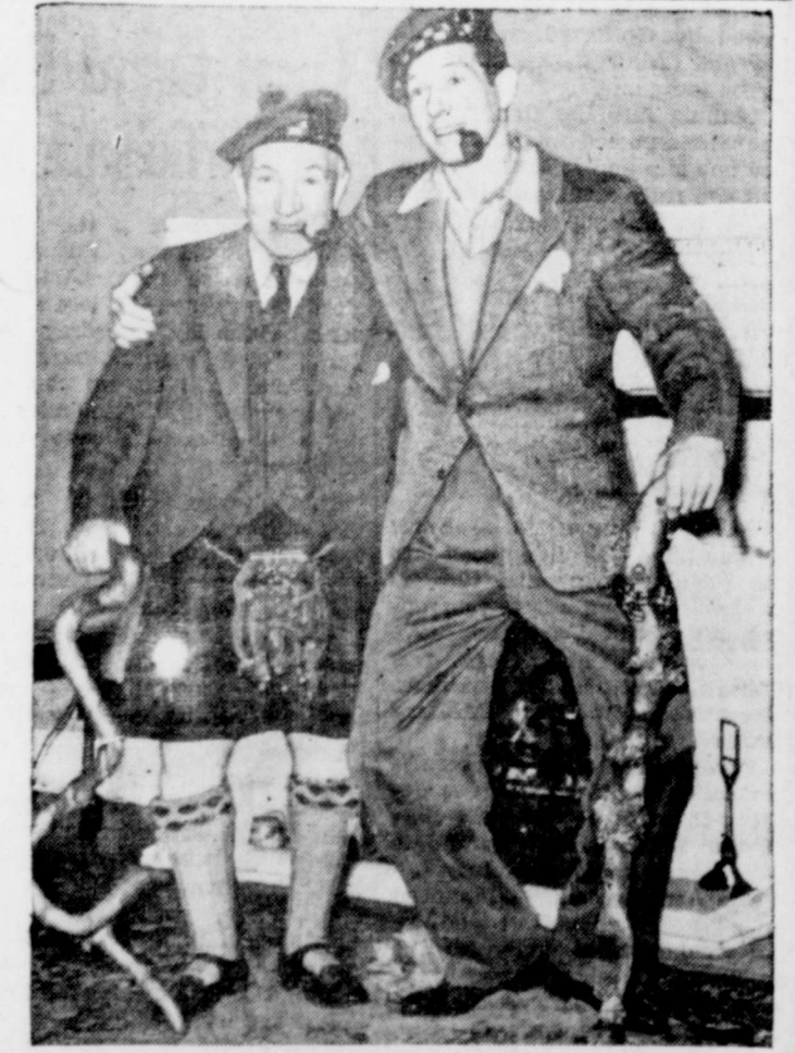
LEARNING HIS LESSONS —During a trip to Glasgow, comedian Danny Kaye visited Sir Harry Lauder, left. He received a blackthorn stick and instructions in the Scottish burr from Sir Harry who Kaye may impersonate in a Hollywood film.