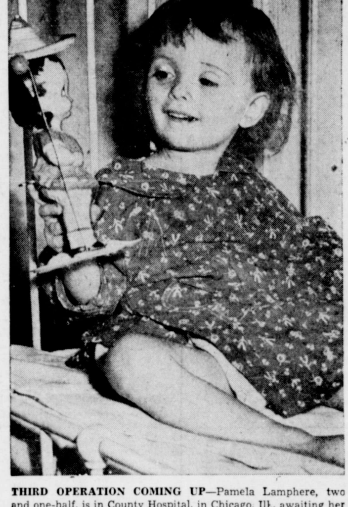
and one-half, is in County Hospital, in Chicago, Ilk, awaiting her third operation to correct a natal condition of an outside bladder. The case drew nationwide attention when her parents were about to separate over whether the first operation should be performed.

All local members and those visiting from Cisco were asked to bring well packed lunch bas-