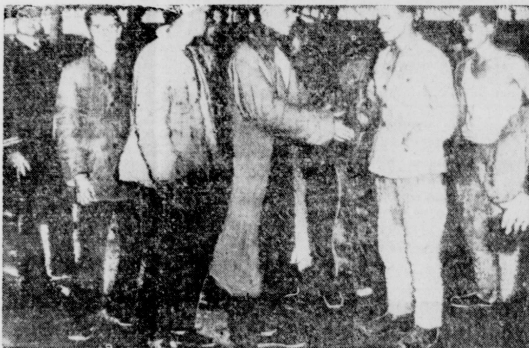
Wearing old Chinese cotton-padded uniforms, survivors of the British sloop Amethyst arrive in Shanghai by train. The Amethyst was shelled by Communist forces on the Yangtze River, about 80 miles east of Nankin.