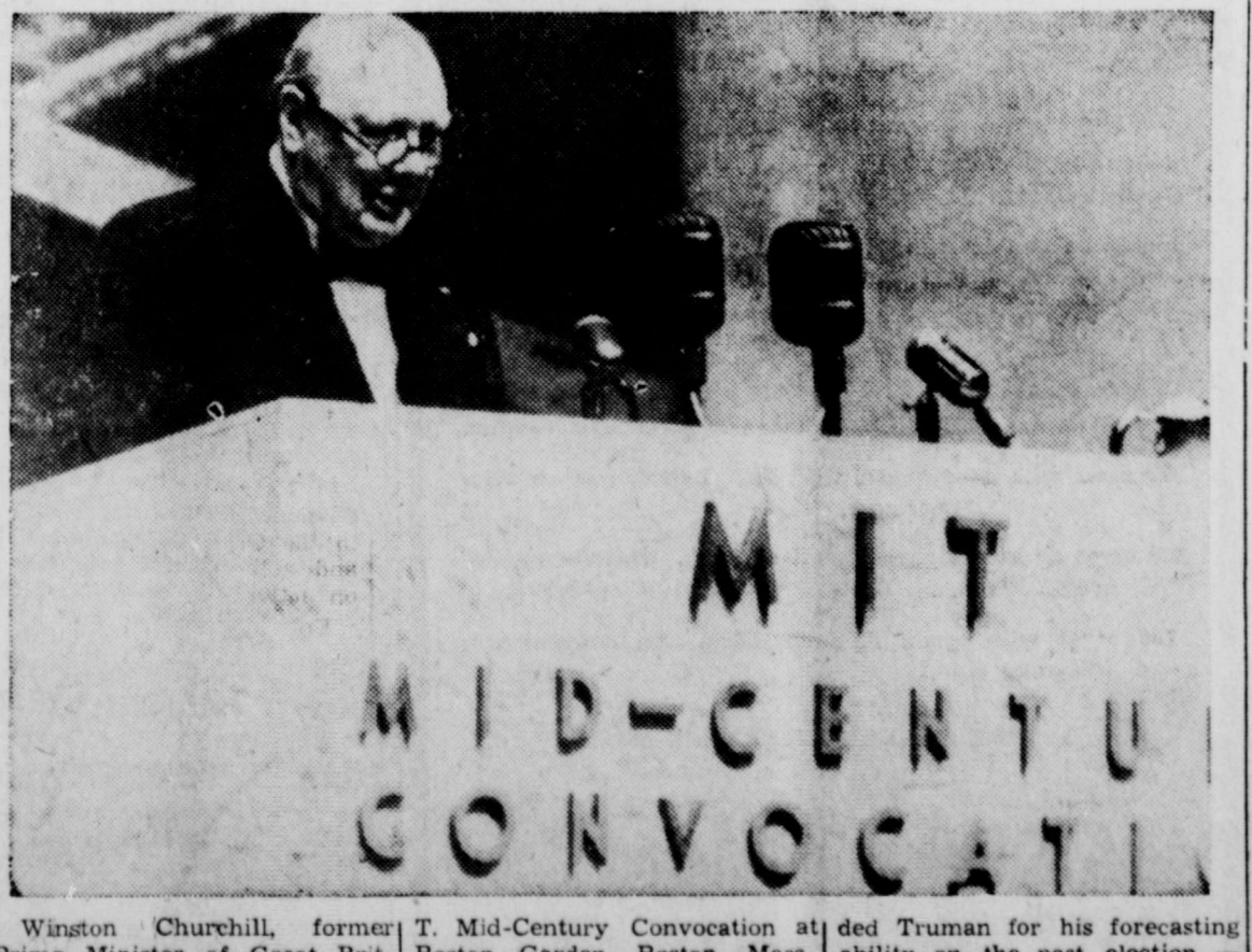
Winston Churchill, former Prime Minister of Great Britain, in an address at the M. I. T. Mid-Century Convocation at Boston Garden, Boston, Mass., smiled wryly when he commended Truman for his forecasting ability on the past election.

Cash Value Life Ins. Loans 4 per cent. Save 33 and one third at YOUR BANK. 1ST NAT'L in Cisco—Mbr. F. D. I. C.