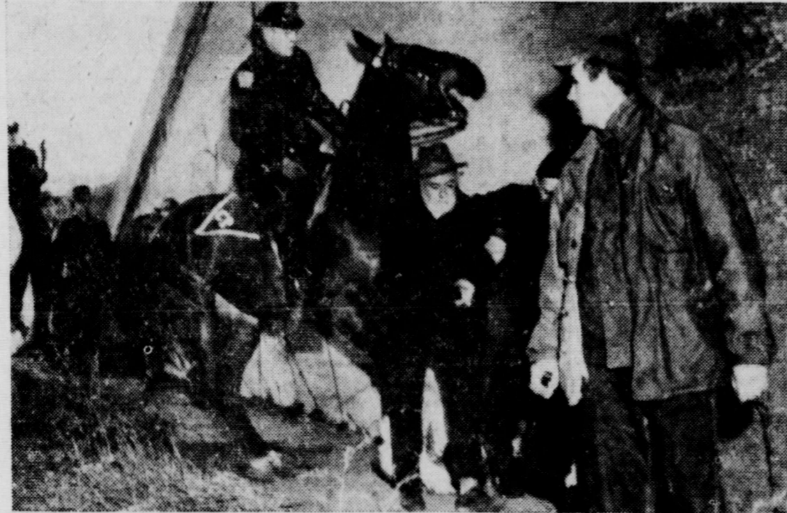
Non-striking workers at the Fawick Airflex Corporation, in the suburban Brooklyn Village, Cleveland, Ohio, entered the plant in comparative quiet following an outbreak of violence. The only skirmish during this period was when a mounted patrolman, above, routed pickets from under a railroad underpass through which workers passed to reach the plant.