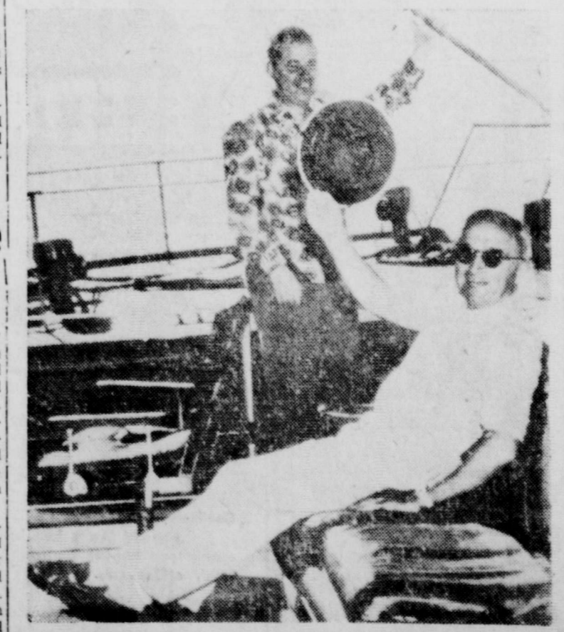
President Truman waves to Navy personnel on shore leave as he shoves off from Key West, Florida, on one of his rare fishing trips.