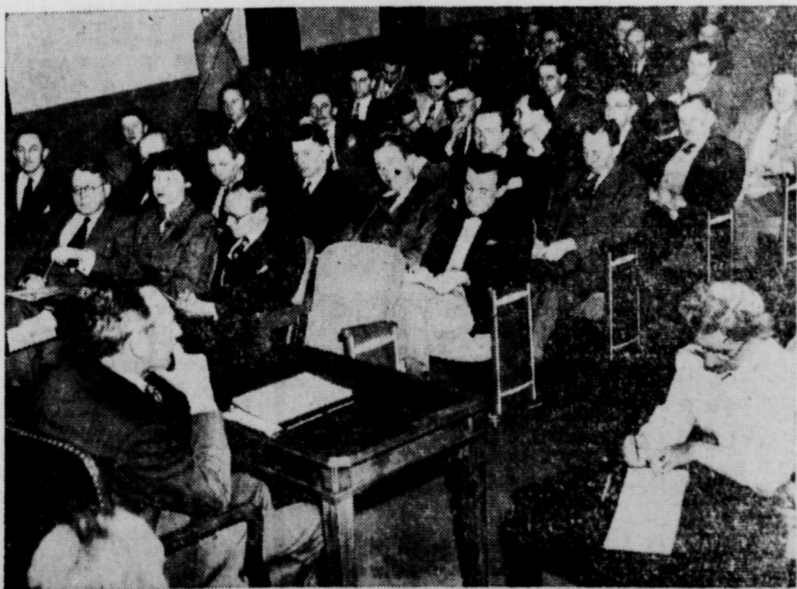
Secretary of State Dean Acheson faces newsmen in the auditorium of the State Department in Washington to explain the details of the North Atlantic Pact.