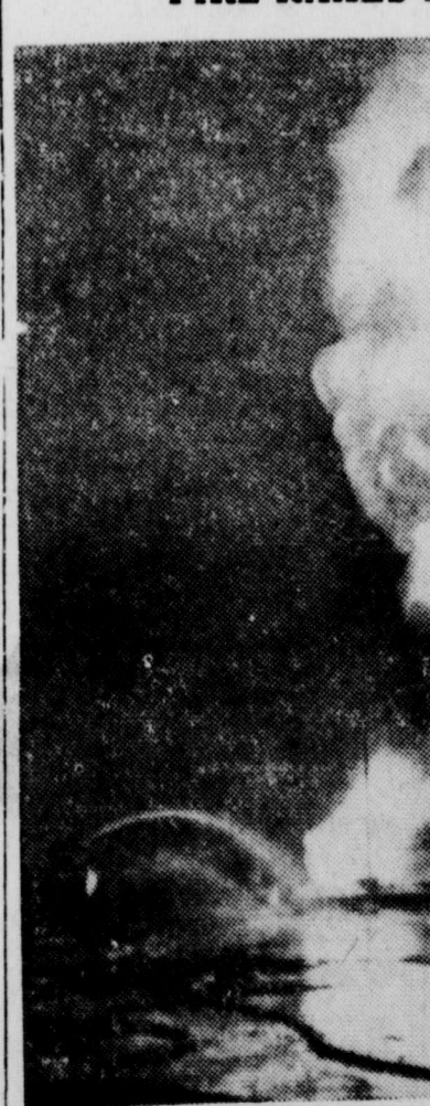
Explosion of oil drums rocks area of Oakland, California, as a million dollar fire rages on piers and warehouses at the Oakland Army Base, Port of Embarcation. The supplies were