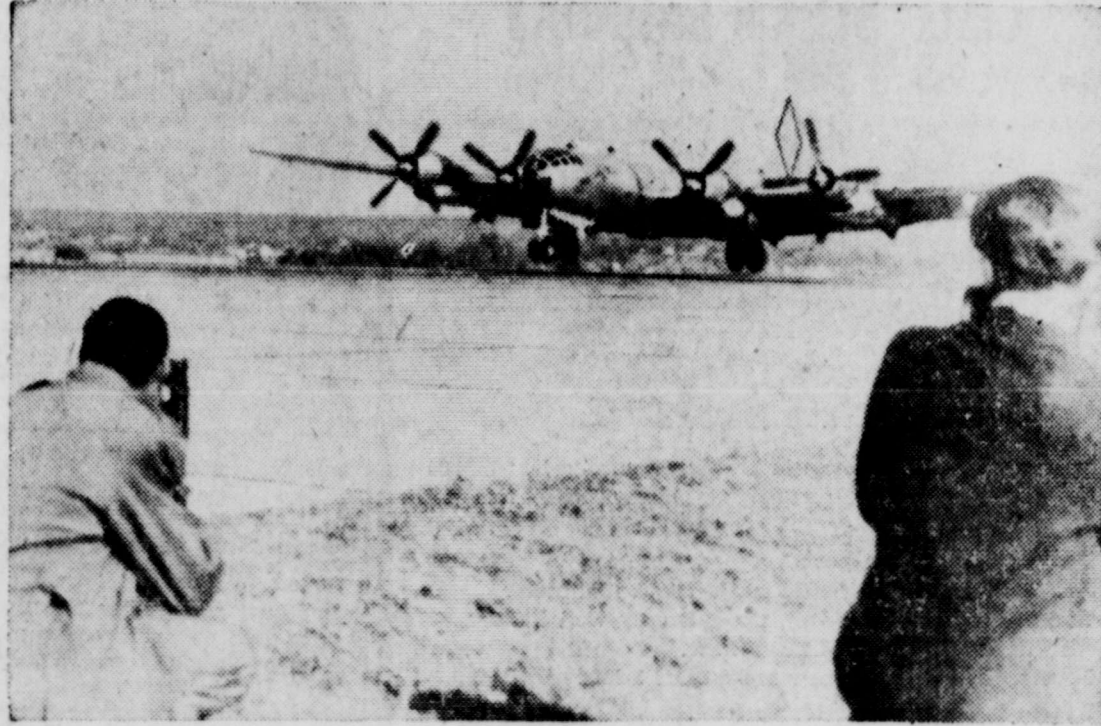
The B-50 Superfortress Force Base in Fort Worth early which started from this base "Lucky Lady II," touches down March 2, after completing a four days previous. on the runway at Carswell Air Force Base in Fort Worth, round the world, non-stop flight.