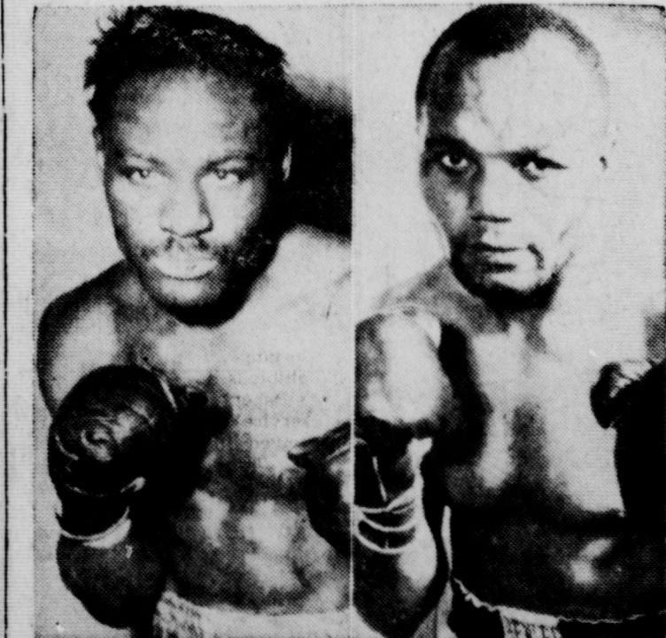
Heavyweight Champion Joe Louis vacated his title and has announced the promotion of a heavyweight championship fight between Ezzard Charles, left and Jersey Joe Walcott, right.