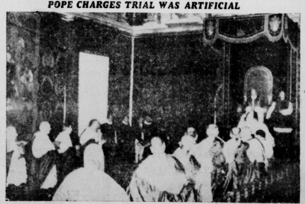
Seated on the gilded throne in XII faces the assembled Cardi- | Cardinals to protest the trial and Consistory Hall inside the Vat- nals in an extraordinary secret sentencing of Cardinal Mindsican City at Rome, Pope Pius Consistory. The Pope called the zenty of Hungary.