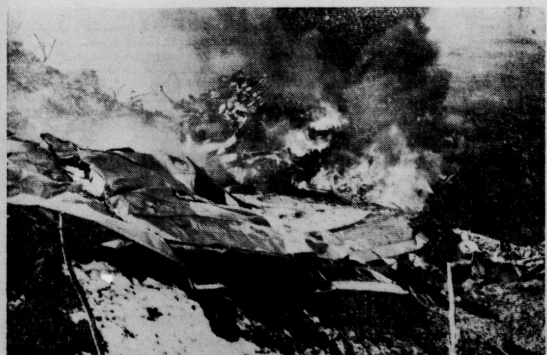
One of two B-25 Air Force planes which collided near the range station south of Barksdale. Two men were killed and 5 were hurt when the planes crashed. Debris was scattered over a wide area.