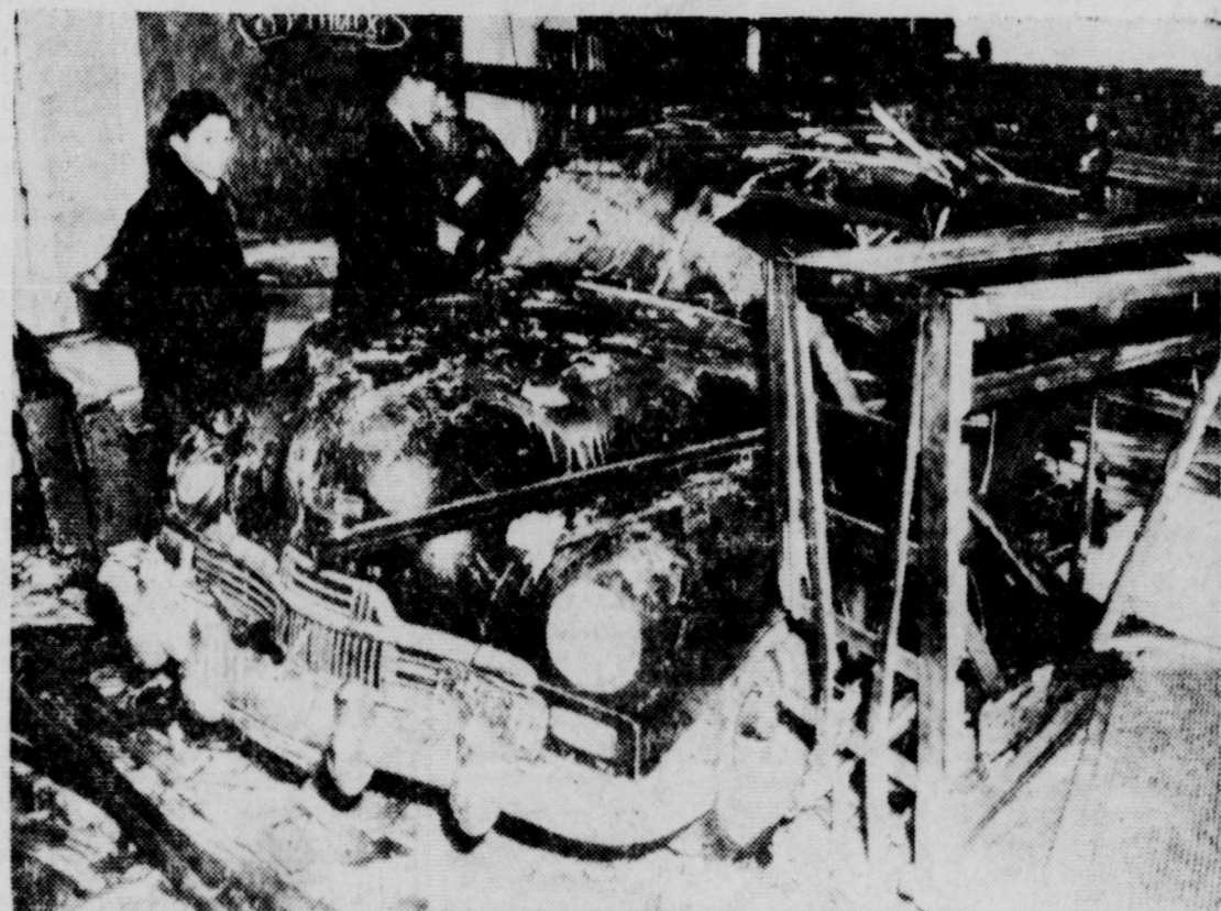
One person was killed and two were injured when a runaway car crashed into a doughnut factory in Pittsburgh. The woman who was killed was working at the wrecked bench making do-