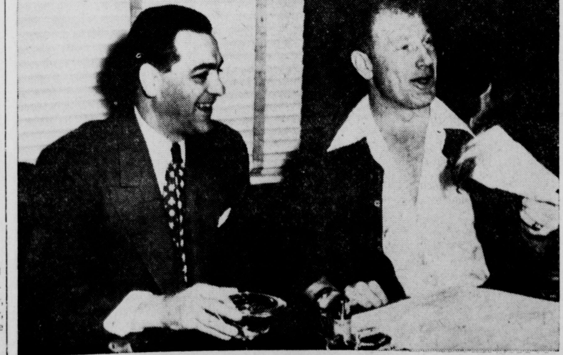
Player - Manager of the Cleveland Indians Lou Boudreau, left, watches as Indian President Bill Vecek burns the

old 1948-49 contract. The contract which Boudreau signed will make him "one of the highest paid players in the game.