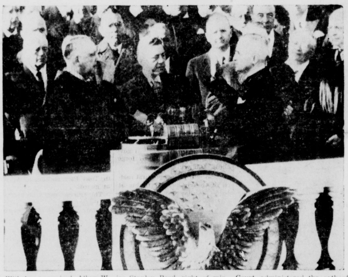
dent of the United States. Just-