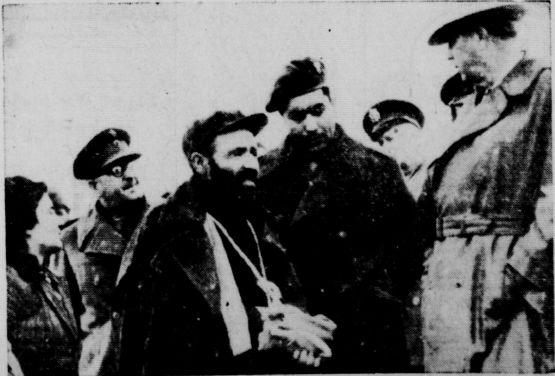
Secretary of the Army Kenneth Royall, right, questions captured Greek guerrillas during a recent visit to Greek fighting area near Argos, Greece, Royall also inspected the Greek Army installatoins during European tour.

Ranch and Farm Production LOANS No Red Tape—Competitive Rates 187 N.W. in Cisco—Mbr. F. D. I. C.