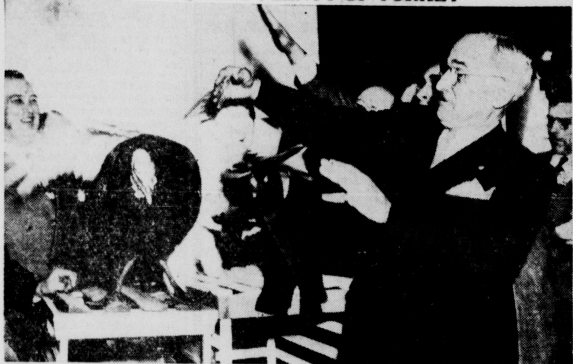
President Truman is a little taken by surprise following his introduction to the "one Tom that got into the White House"—a 40 pound turkey. The 40-pound bronze turkey and a 14-pound one, discernable in background were presented the Chief Executive by the President of the National Turkey Federation and the President of the Virginia State Turkey Assn. President Truman said he would take both turkeys home to Independence for Christmas where his 25 relatives required a lot