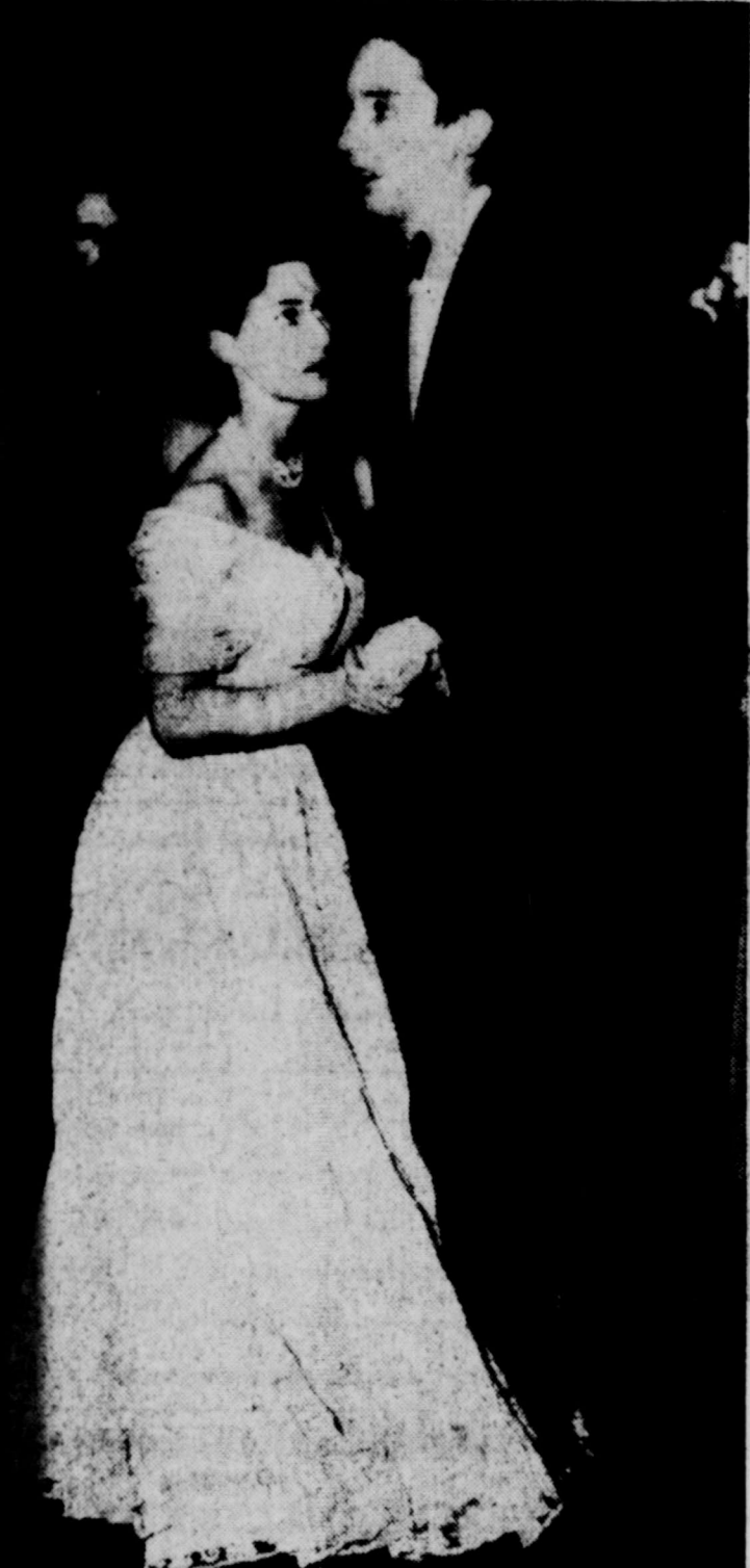
criticism of Princess Margaret Rose's late hours by London papers may result in a curfew for her—as it has for many teen-agers. The 18-year-old princess is shown here at a "late" party dancing a Samba with an unidentified escort at the British Empire Nurses' Memorial Ball.