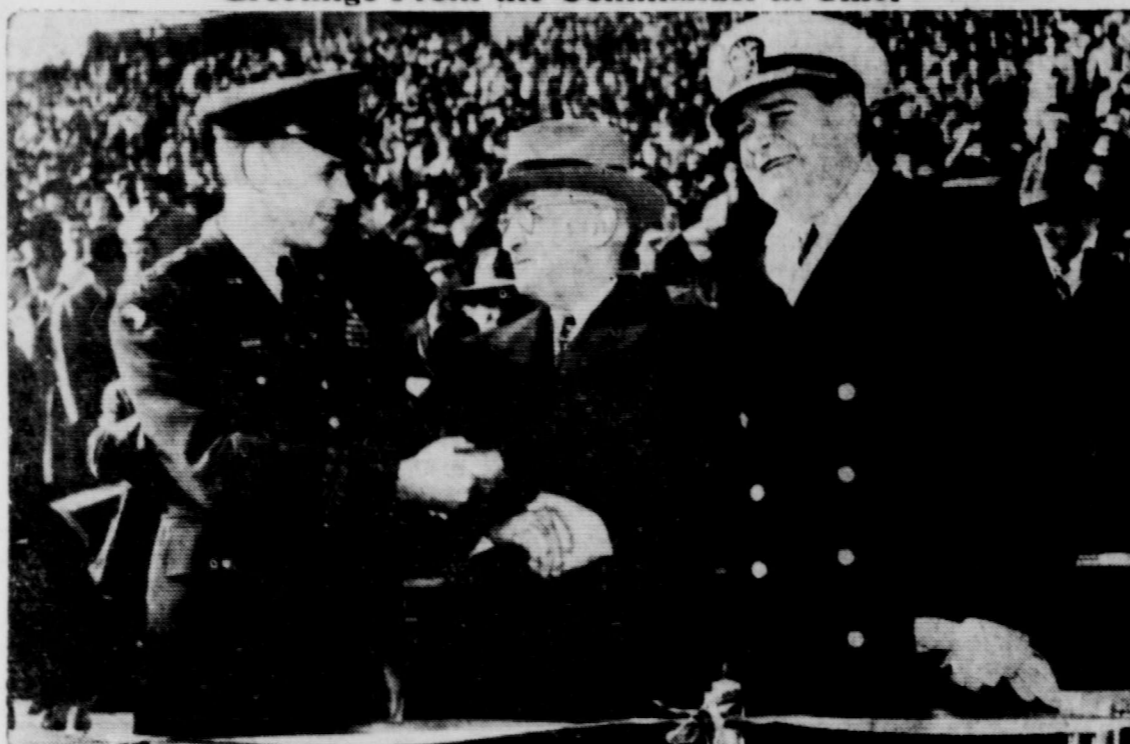
At the Army-Navy game in Philadelphia, President Tarry S. Truman exchanges handshakes with Maj.-Gen. Maxwell Taylor (left), head of the U. S. Military Academy, and Rear Adm. James L. Holloway, head of the U. S. Naval Academy.