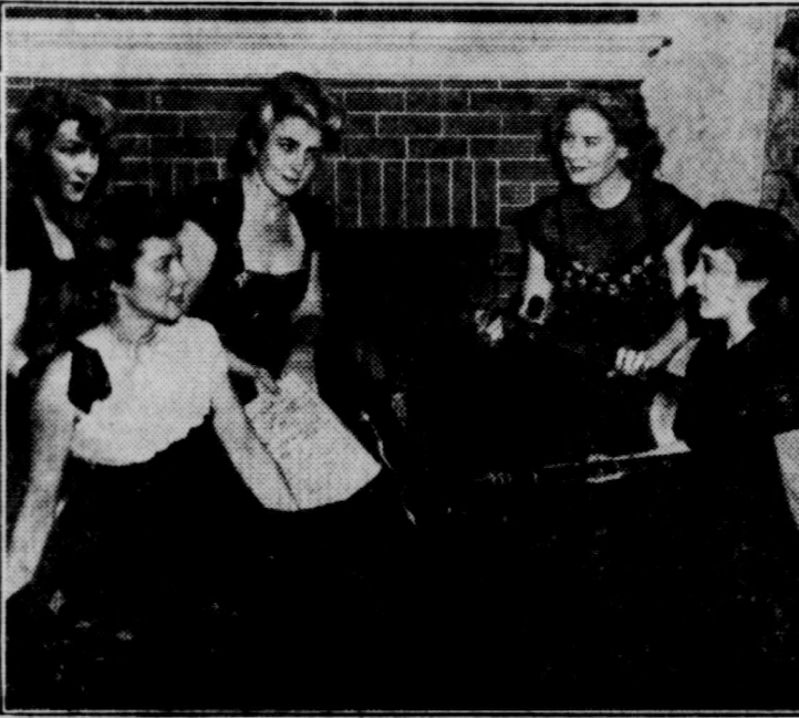
THE BARY ENSEMBLE