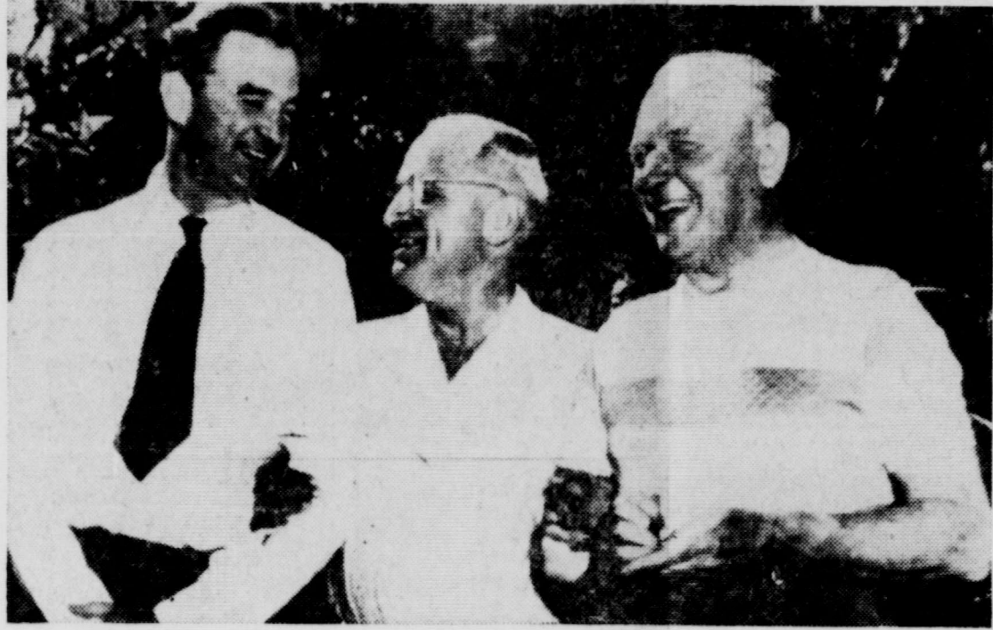
Secretary of Air Stuart Symington, left, and Governor Wallgren of Washington, visit with President Truman at the Little White House at Key West, Florida.