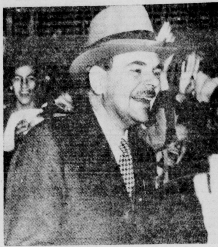
Governor Thomas E. Dewey wears a broad grin as he accepts the welcome of an estimated 5000 persons who turned out to greet him at the Tucson, Ariz., airport. Governor Dewey will vacation in Tucson with his wife and sons.

way tape bound firmly around his ankles.