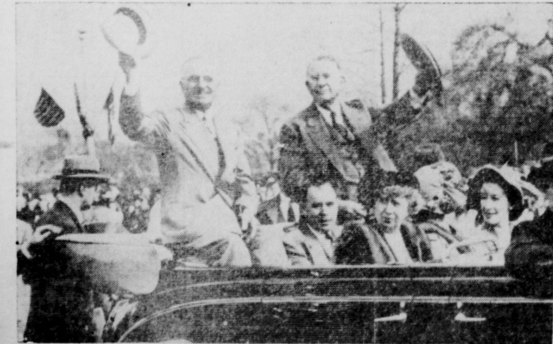
Victorious President Truman and Vice-President-elect Alben Barkley wave to the crowds massing along Pennsylvania Avenue to welcome the returning "champs", left to right: President Truman; Senator Barkley, in the car, seated; Senator J. Howard McGrath; Mrs. Truman, and Margaret, with back to camera.