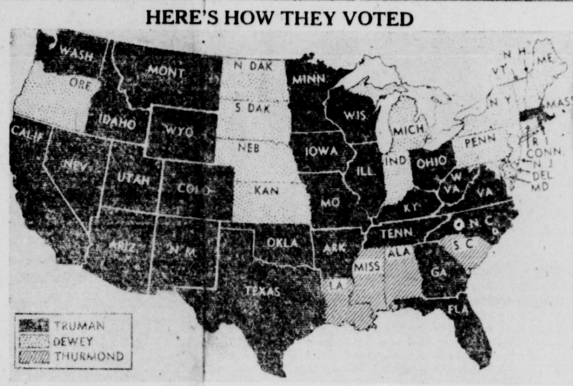
HERE'S HOW THEY VOTED. Here's how the states voted in the presidential election, based on almost complete returns. Totals gave Truman 28 states with 304 electoral votes; Dewey 16 states with 189 electoral votes and Thurmond four states with 38 electoral votes. Returns in California, shown for Truman, and North Dakota, shown for Dewey, were not final, but trends indicated states would go as shown here.