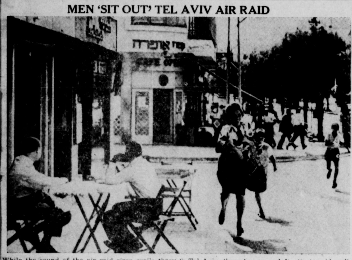
sound of the air raid siren wails through Tel Aviv, these two men, left, sit at a sidewalk afe table, apparently decided to "sit this one out." The woman and children though, scurry for shelter from the Egyptian planes which have bombed the Israel city occasionally.